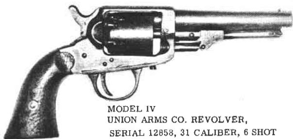
MODEL IV UNION ARMS CO. REVOLVER, SERIAL 12858, 31 CALIBER, 6 SHOT

The barrel lengths of the two specimens examined are 4" and 4-3/8".