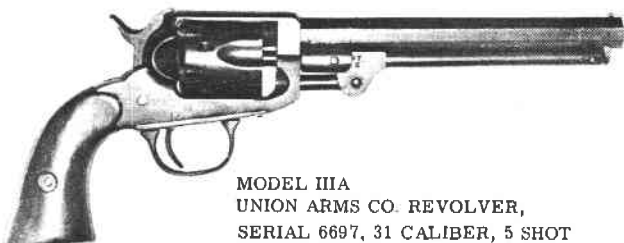
MODEL IIIA UNION ARMS CO. REVOLVER, SERIAL 6697, 31 CALIBER, 5 SHOT

MODEL III A. Differs from Model III only in having (1) a brass plate into which the trigger guard is set; (2) a sighting groove in the flat over the cylinder. The serial number of the Specimen examined is #6697. The barrel length of this sample 6-1/4" and is the only specimen so far noted with this length.