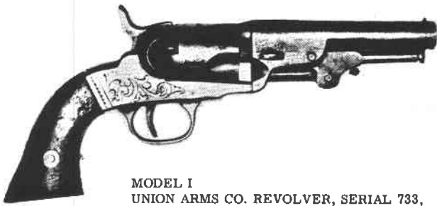
MODEL I UNION ARMS CO. REVOLVER, SERIAL 733. 31 CALIBER, 5 SHOTS

This model has the lowest serial #733 so far recorded, and it is for that reason I am classifying it as model I.