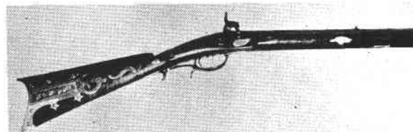
#7 ADOLPHUS MEIER & CO., ST. LOUIS ON LOCK, KENTUCKY TYPE RIFLE, 43" BBL, .32 CAL., WT. 10#, OBSCURE INITIALS ON BBL TOP, ALL BRASS FURNITURE AND IN-LAYS, SET TRIGGER, FANCY GRADE