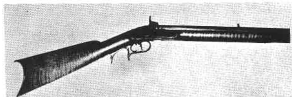
#8 ST. LOUIS KENTUCKY TYPE RIFLE, .36 CAL., WT 10#, MAKER UNKNOWN, LOCK ENGRAVED, BARREL MARKED E.T. HEBB, ST. LOUIS ON LOCK, DBL SET TRIGGER, BRASS FURNITURE