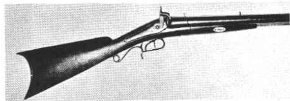
#6 H.E. DIMICK ON RIGHT BARREL, ST. LOUIS ON LEFT BARREL, SIDE BY SIDE, 10 GAUGE SHOT AND .58 CAL RIFLE, 32" BARRELS WITH ELG PROOF ON BOTTOM, AT BACK ACTION LOCKS, SET TRIGGER ON RIFLE BARREL, DAMASCUS BARRELS, WT., 12#