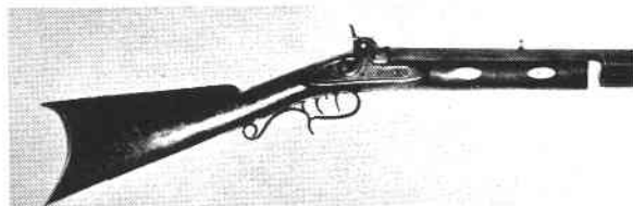
#5 H. E. DIMICK ST. LOUIS, 2 LINES, .45 CAL., 31 3/4" Oct. Bbl., 2 BBL KEYS, 13# Wt., 6 LANDS, LEFT TWIST, PLAIN LOCK TYPICAL ST. LOUIS PATTERN, TYPICAL IRON TRIGGER GUARD, SET TRIGGER, HOLES FOR BULLET STARTER