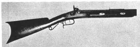
#4 H.E. DIMICK, ST. LOUIS, 2 LINES, 10# WT., 32" OCT BBL., .40 CAL., LEFT TWIST, 6 LANDS, 2 PINS, BBL KEYS, TYPICAL IRON GUARD, UNMARKED ST. LOUIS PATTERN LOCK, TURNED FOR STARTER