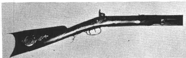
#3 H.E. DIMICK & CO., ST. LOUIS, (2 LINE), 33-1/2" BBL., .50 CAL., OCT. 1 PIN, SILVER FURNITURE, 6 LANDS, LEFT TWIST, FANCHEST GRADE, PATCH BOX, DEER, BACK ACTION LOCK, WT. 11#, CUSTOMED FOR P.H. KELLEY, DBL SET TRIGGER