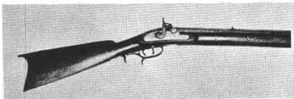
#2 S. HAWKEN, ST. LOUIS, (1 LINE), 38" BBL., .50 CAL, OCT. 1 PIN, BRASS FURNITURE, NON-CURL TRIGGER GUARD, DBL. SET TRIGGER, TYPICAL PLAIN LOCK, 7 LANDS, R. TWIST, WT. 12#, VERY EARLY TYPE, NOT PATENT BREECH, IT IS KNOWN THIS TYPE WAS MADE.