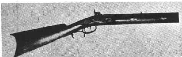
#1 S. HAWKEN, ST. LOUIS (1 LINE), 33-3/4" BBL., .50 CAL, OCT., 2 PIN, IRON FURNITURE NON-CURL TRIGGER GUARD, DBL. SET TRIGGER, PLAIN ST. LOUIS TYPE LOCK, 7 LANDS, RIGHT TWIST, WT. 10#, NEAR MINT CONDITION.