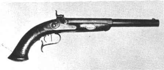
#10 ONE OF A POSSIBLE PAIR, SEEMS ST. LOUIS MADE, 11" .50 CAL OCT & ROUND BBL, PLAIN IRON FURNITURE, DBL. SET TRIGGER, PLAIN ST. LOUIS LOCK, STAMPED H.E. DIMICK & CO., ST. LOUIS.