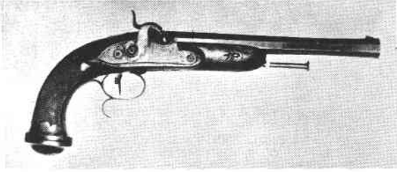
#9 ONE OF A MATCHED PAIR MADE FOR H.E.DIMICK, ST.LOUIS, PROBABLY FRENCH MANUFACTURE, 10" MICRO GROVE .56 CAL BBL., IRON FURNITURE, ADJUSTABLE SINGLE SET TRIGGER, FINELY MADE ENGRAVED LOCK.