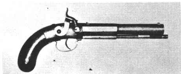
#11 H.E.DIMICK & CO., ST.LOUIS, 2 LINE, AMERICAN MADE HALF ROUND HALF OCT. 6" BBL., .44 CAL, ALL INSPECTOR MARK INITIALS CHECK WITH KNOWN DIMICK EMPLOYEES, MARKINGS ON BBL DIE STRUCK, TYPICAL ST.LOUIS PATTERN