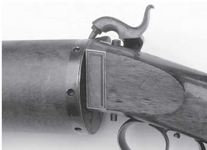
Figure 10. Close up view of left side showing tapered "take down" pin.

This William Billingshurst Cylinder Rifle is engraved on the fancy, case hardened patch (actually beeswax) box with the inscription "R. P. Eldredge/Mt. Clemens (sic)/Mich.". The rifle is caliber .44 and has a 26-3/4" octagonal barrel. It has a seven shot rifled cylinder that measures 3-3/8" in length. The iron parts are casehardened except for the barrel and cylinder that are browned, and the adjustable tang sight and rear sight that are heat blued. The forend cap is pewter. The burled walnut stocks appear to have been polished with several coats of a hand rubbed oil finish. The buttstock has coarse checkering at the wrist. The hickory ramrod has an iron worm with a threaded brass cover as well as a counter-sunk brass head for engaging the end of the patched bullet. There is a tapered pin immediately behind the cylinder that upon its removal, allows the rifle to be "taken down" into two parts; the frame, lock and buttstock separating from the cylinder, cylinder pin, barrel and forestock. Apparently there was a special wrench that engages the rear end of the cylinder pin allowing it to be removed from the barrel for cleaning. Finally, the rifle has a single set trigger.