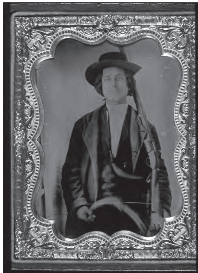
Figure 3. Quarter plate Ambrotype showing Millar Patent Rifle.