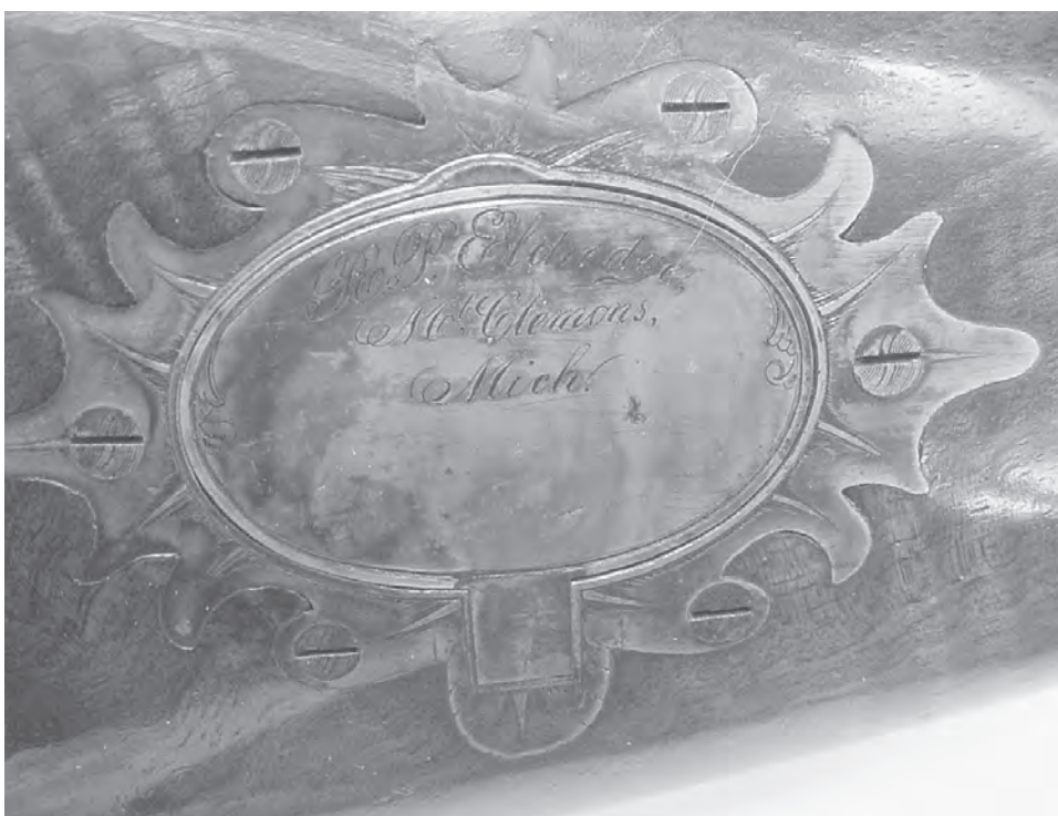
Figure 7. Patch (Beeswax) Box with inscription.

the path that his father had for him to have a “liberal education”. 14 After teaching school for a short time, he heard Detroit was the place of opportunity, so in 1826 he made his way through Rochester to Buffalo and finally to Detroit by traveling on stagecoach, canal packet and steamer. 15 It is family legend that he arrived there with only ten shillings and the clothes on his back. For the next two years he supported himself by teaching in one of the poor-debtors rooms of the old stone jail,