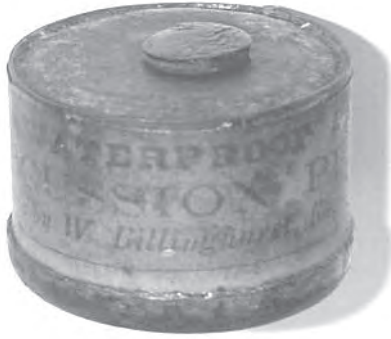
Figure 5. Billinghamurst Pill Primer container.

his own words, 'When you are in the woods, with one of the above guns, you feel that you are monarch of all you survey, and do not fear anything that wears hair.' ". 10