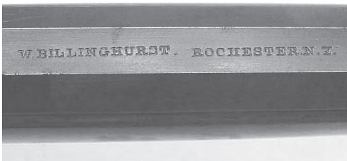
Figure 1. Barrel Marking.