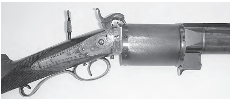
Figure 6. Right side view of rifle.

ing stop, with the firing of a bullet that was ignited by a pill-lock or “a lock that will prime itself”. It had nothing to do with the automatic rotation and indexing of the cylinder in any revolving arm, which was the basic principle of the first Colt patent. There are hand revolved cylinder arms going back to the age of the matchlock, so this principle was hardly the idea of the Millars. I would imagine that there are some Millar descendants out there still lamenting that idea that their ancestors “gave away the farm”.