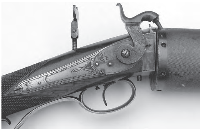
Figure 9. Close up view of lock plate and tang sight.