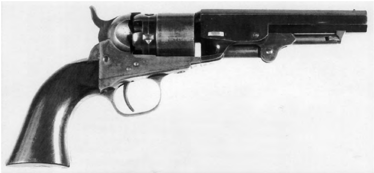
Figure 2. "Pocket Model of Navy Caliber" .36 caliber percussion pistol. Note octagon barrel, hinged ramrod, and round, roll engraved cylinder. As noted in Figure 1 , other parts are common with the "1862 Police."