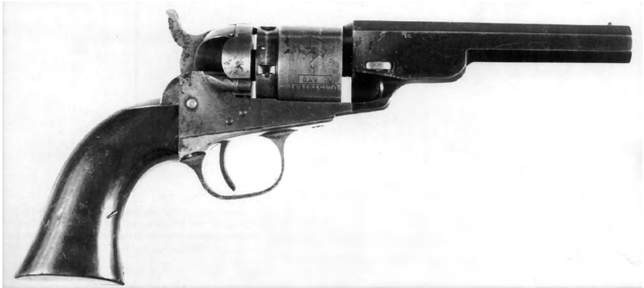
Figure 3. New Model Breech Loading Pocket Pistol. With loading gate, newly made as a cartridge pistol from modified percussion parts.

Unfortunately, none of them had the advantage of the research on the two .36 caliber pistols that this paper represents. As someone wiser than I said, "We see further because we stand on the shoulders of those who have gone before us."