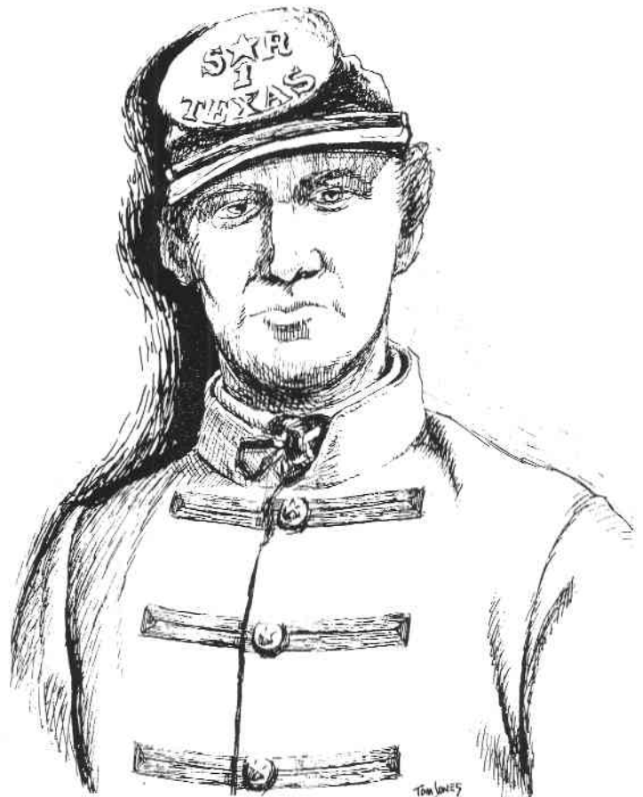
Artist's sketch of a member of Hood's Texas Brigade (1st Texas Infantry Regiment), Army of Northern Virginia, C.S.A. The SR on the kepi stands for "Star Rifles." All letters cut from sheet brass.