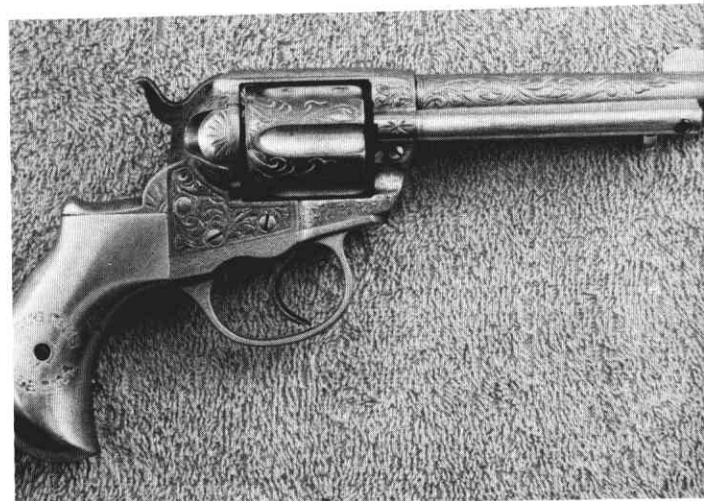
Colt Thunderer #138671 presented to Pat Garrett when he was Customs Inspector in 1903.

This brief glimpse into the development of El Paso from a dusty shanty town to a modern-day metropolis offers but a select few personalities and instances that illustrate how the gun, the outlaw, and the settlers interacted through El Paso's history.