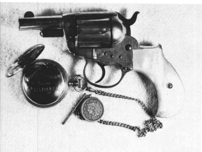
John Wesley Hardin's Colt Lightning #84304, his Elgin watch #4069110. Presented to him by James B. Miller on Apr. 7, 1895.