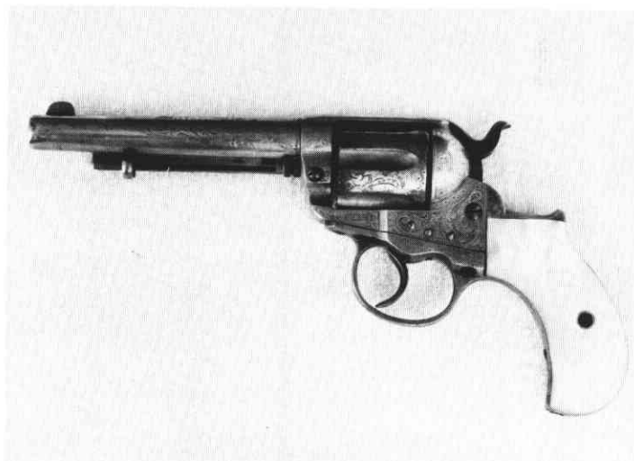
Wes Hardin's Colt Thunderer taken from him on May 2, 1895.

Probably the most famous of the gunfighters to come to El Paso was John Wesley Hardin. Hardin came here in April of 1895 to help a relative in a legal matter. During his 15 years in the Texas State Prison, Hardin had studied law and upon his release in 1894 passed the bar examination. Jim Miller, a notorious killer in his own right, was married to Hardin's niece and asked for the gunman's help in prosecuting an enemy. After a short trial, which ended in a