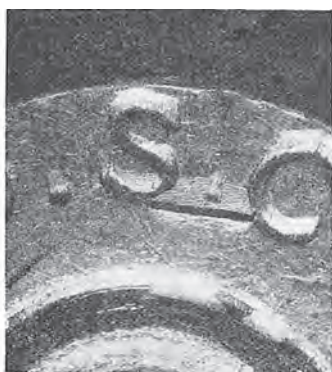
Plate 12. Mark left on shell rim by ejector of first Thompson gun. Note parallel lines duplicating those present on ejector in Plate 11.