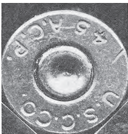
Plate 15. Firing pin imprint with elevation at base of crater, left on shell fired in 2nd Thompson gun.