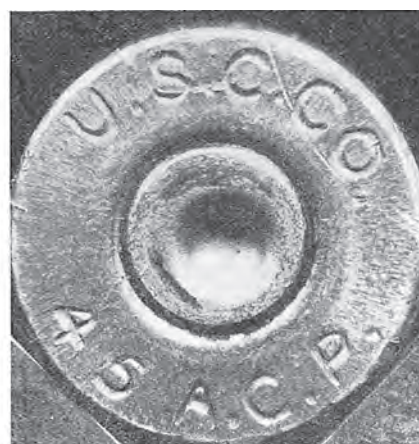
Plate 14. Smooth concave firing pin imprint left in primer of shell fired in first Thompson gun.