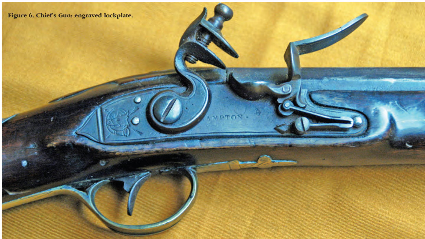
Figure 6. Chief's Gun: engraved lockplate.