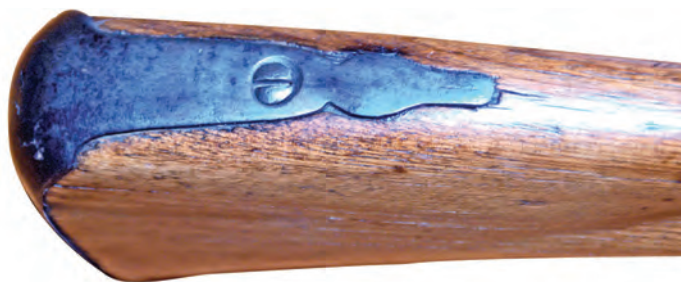
Figure 9. French Fusil de Chasse: butt tangs.