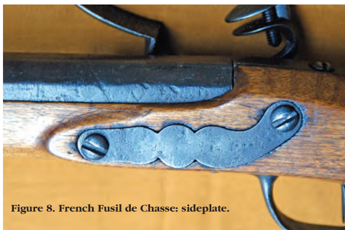
Figure 8. French Fusil de Chasse: sideplate.