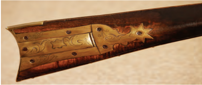
This is an early example of what became the Guilford "Twisted Star" or "Daisy" style Brass Patchbox.