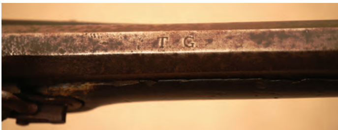
Thaddeus Gardner's Stamp Signature on barrel.