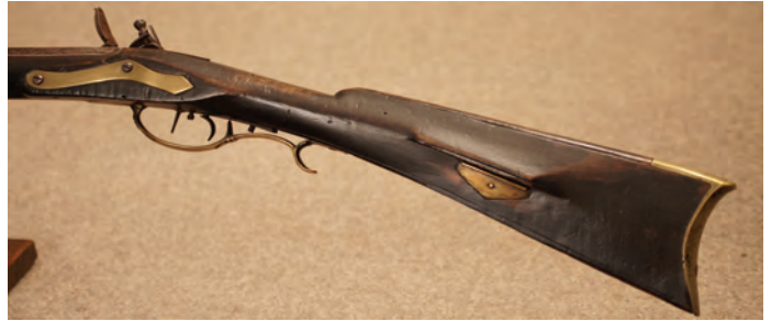
Check Rest with Pick Holder & early two screw side-plate.