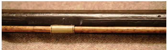
This is the earliest example I have seen of Guilford Broken-style forestock molding which starts and stops on either side of the thimble. On many later full-stock patchbox rifles the Broken-style molding stops and starts on either side of a silver inlay, usually in the shape of a diamond.