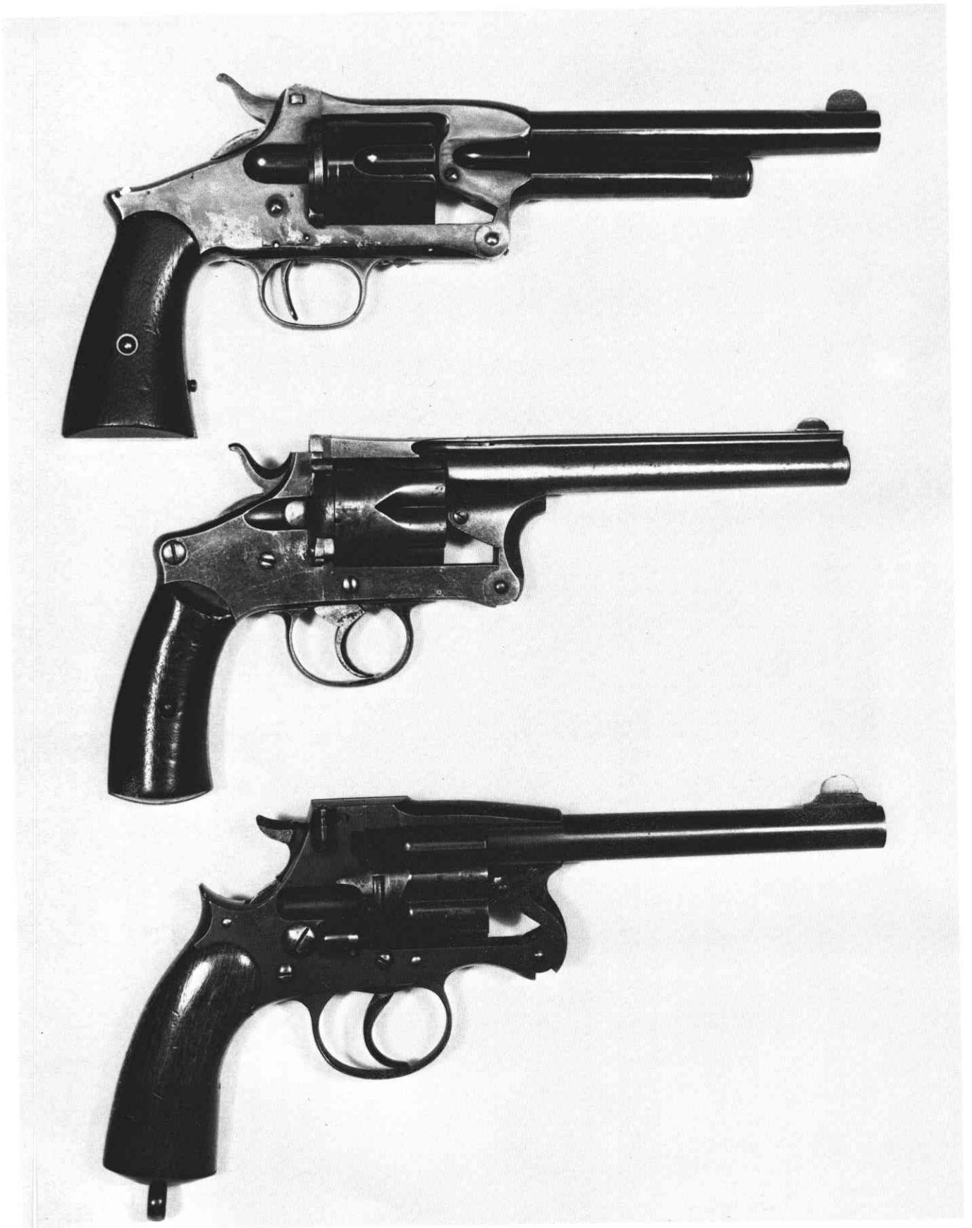
The three Owen Jones revolvers: top, No. 8; center, the unmarked specimen; bottom, Enfield Mark II No. 281.