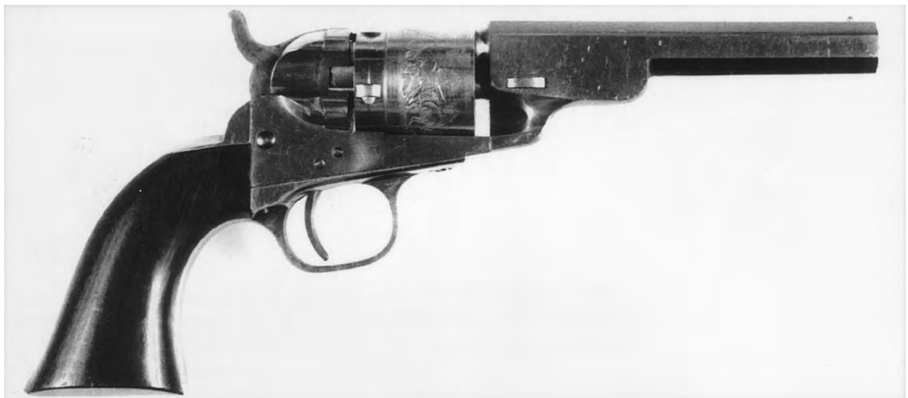
Figure 4. New Model Breech Loading Pocket Pistol. Without loading gate, converted from a previously finished "Pocket Model of Navy Caliber.". Robert B. Berryman photograph.

That, in turn, allowed us to separate octagon barreled Pocket Model breechloaders with gates, (Figure 3), as a separate type from those without gates (Figure 4). All octagon barreled Pocket Model breechloaders with gates were originally made as cartridge guns; all such guns without gates were converted from percussion.