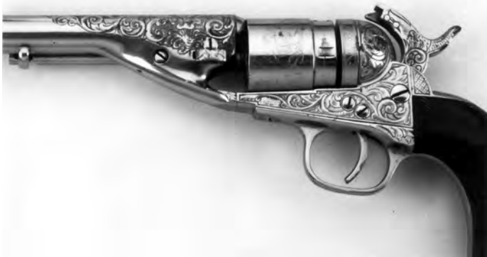
Figure 9. “Heavy Scroll with Punched Dot Background on a converted “1862 Police,” Serial Number 42646 ECN, engraved as a percussion. Note heavy, wide scrolls. John D. Breslin Collection, Paul Goodwin Photograph.

patterns) used only in 1869-70, one that R. L. Wilson has designated the “Heavy Leaf Scroll” (and “Heavy Scroll with Punched Dot”) pattern. 23 (see Figures 9 and 10).