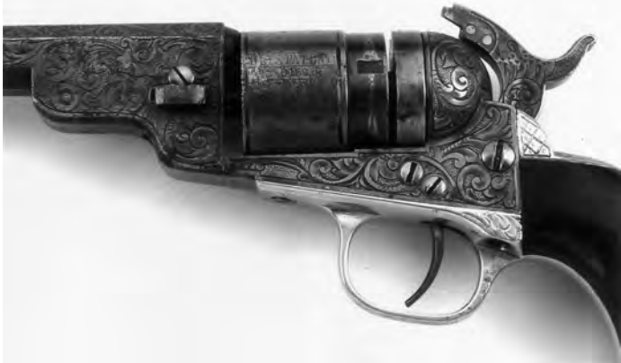
Figure 10. “Heavy Scroll with Punched Dot Background” on a converted “Pocket Model of Navy Caliber,” Serial Number 20150 E, engraved as a percussion. Again note heavy, wide scrolls. John D. Breslin Collection, Paul Goodwin Photograph.

It can be seen that the Late Vine style was not used for the 1860 Army before 1864, but was used almost exclusively from 1860 until 1869-70. About 1870, the new Heavy Leaf and Heavy Scroll styles of engraving were introduced for what may have been only a few months.