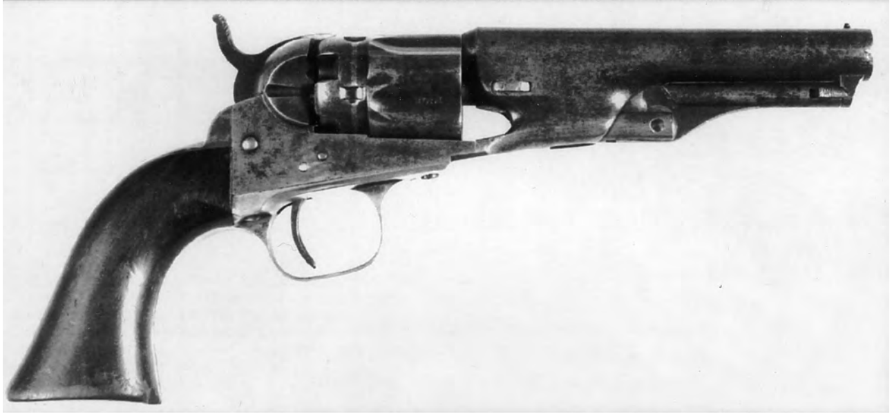
Figure 1. "1862 Police" .36 caliber percussion pistol. Note round barrel, "creeping" ramrod, and fluted cylinder. Frame, grips, back strap, triggerguard and other parts are common with the "Pocket Model of Navy Caliber" in Figure 2.