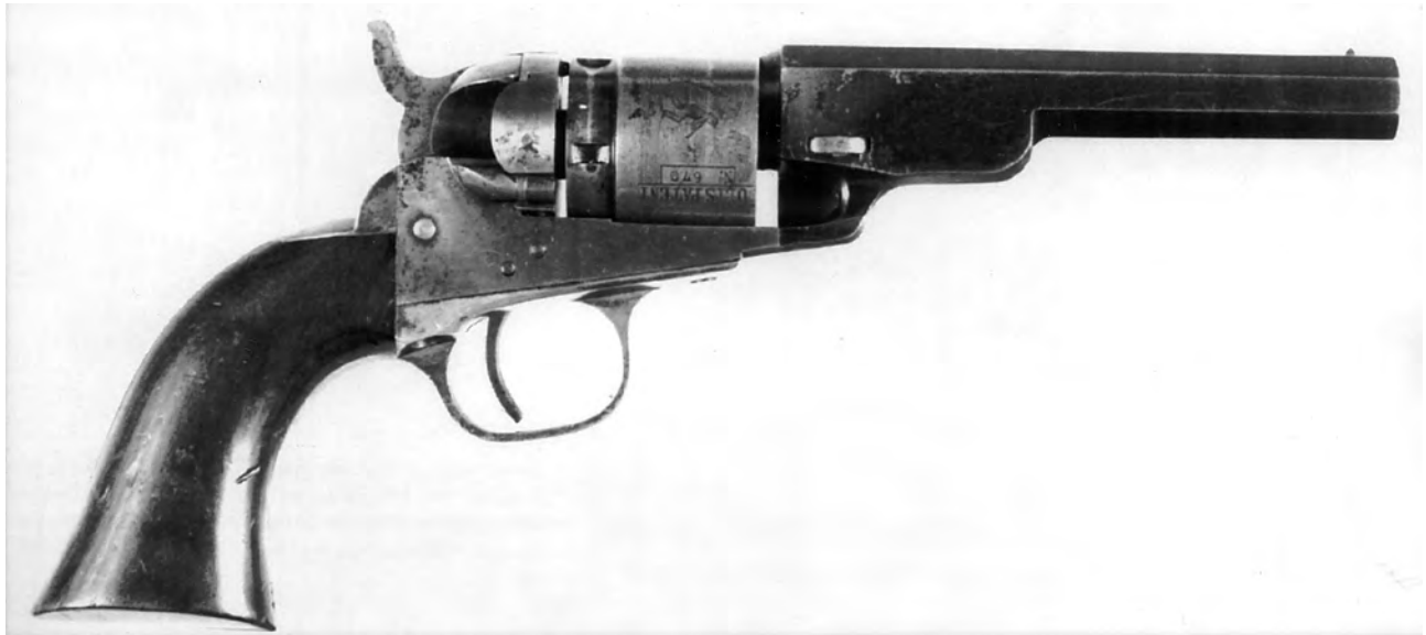
Figure 3. New Model Breech Loading Pocket Pistol. With loading gate, newly made as a cartridge pistol from modified percussion parts.

Unfortunately, none of them had the advantage of the research on the two .36 caliber pistols that this paper represents. As someone wiser than I said, "We see further because we stand on the shoulders of those who have gone before us."