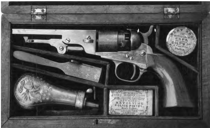
Figure 13. The “1865 New Model Pocket .36 caliber.” Or, the “1865 Pocket Navy.” John D. Breslin Collection, Paul Goodwin Photograph.

I have always disliked the name “Pocket Model of Navy Caliber”—it takes too long to type. I would like to suggest “1865 Pocket Navy.”