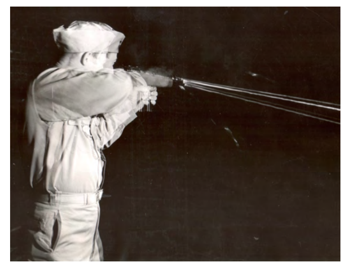
Figure 16. In this photo dated 1/8/41, a representative of the USMC test fires a Reising Model 50 Submachine Gun with tracer rounds.

The Reising Model 50 project became H&R's first federal weapons contract. Existing production of the Model 50 occurred under normal H&R processes of hand-fitting parts to each firearm, thus their parts were not manufactured as completely interchangeable. It would have taken H&R a minimum of several months to gear up for production of any weapon with completely interchangeable parts, and it was not their normal production style, so further delays would have likely occurred had they pursued this route. The Marine Corps knew this, and accepted it when they approached and contracted H&R to supply Reising Model 50 Submachine Guns, but they did not effectively communicate it within USMC ranks. This error eventually did much to taint the weapon's initial military service reputation. Because supply was constrained, and the Marines wanted their submachine gun quickly, their normal policies were set aside to accomplish that goal.