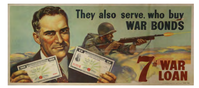
Figure 13. A 7th War Loan poster featured a GI blazing away with a Reising Model 50 Submachine Gun without a magazine.

16). Many police departments were early adopters of the weapon, and it provided reputable service in the law enforcement environment for many years. The Reising SMG tested very well, and was seriously considered for adoption by the Soviet military, who visited H&R, and took delivery of some units. The weapon even appeared in a Soviet manual of the early WWII period, but was not acquired by them in any large numbers. The U.S. Marines became the first to adopt the Reising in large quantity.