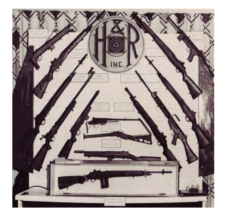
Figure 30. An H&R military product display, circa 1960. At least seven Eugene Reising designed firearms are featured. Clockwise from the top, they are as follows: "Assault" 9 mm Submachine Gun (far upper right), M14 Simulator (3rd down from right), Guerilla Gun (under the T48), Reising Model 50 Submachine Gun (bottom, above M14 Cutaway), "Special Forces" 9 mm Submachine Gun (at 7 o'clock), "Marauder" Tubular receiver M14 Rifle (under M14), Reising Model 55 Submachine Gun (upper left).

difference between a Model 150, and a Model 151 is the rear sight. The Model 150 featured a graduated leaf rear sight installed in a dovetail on the barrel, just forward of the receiver, while the Model 151 retained the Redfield Model 70-AT aperture rear sight as was standard on the previous Models 65 and 165. The Model 150 was cut for a dovetail to install the leaf rear sight, and the Model 151 does not feature a dovetail cut.