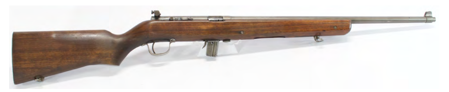
Figure 22. An example of a standard production Model 65 with early features.