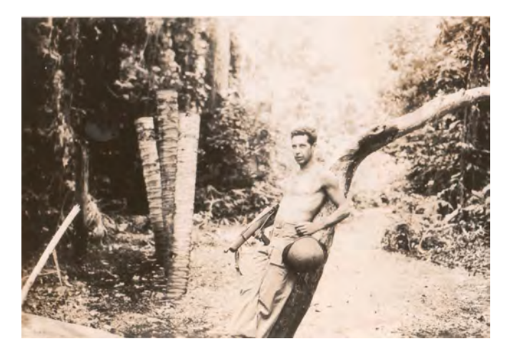
Figure 20. A Marine poses somewhere in the South Pacific during WWII with his Reising Model 55 Submachine Gun.

Figure 19. This morbid WWII H&R advertisement featured the Reising Model 55 Submachine Gun.