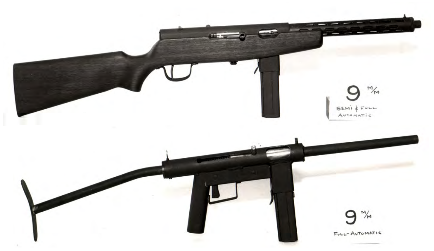
Figure 31. Two Eugene Reising designed 9 mm submachine guns of the late 1950's to early 1960's that never saw production by H&R. The first was nicknamed "Special Forces" (Top) and the second was nicknamed "Assault" (Bottom)

At least 2 Prototype 9mm Submachine Guns (1950's-60's)