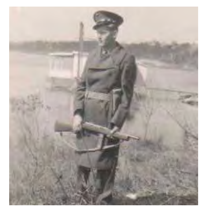
Figure 18. This USMC guard at a domestic location during World War II carried a Reising Model 50 Submachine Gun with a 12-round magazine.

Reising Submachine Guns also served on the U.S. home front during World War II, throughout the country at guard posts of strategically important sites (Figure 18). Some issues had been experienced with maintaining the standard 20-round magazines, with their double row, single feed design being prone to feel lip alignment issues due to poor Marine training on them, so a 12-round magazine was designed that improved magazine reliability. Many of the home guard use Reising M50s were furnished with these magazines. A special magazine housing was also designed that only allowed insertion of 12-rounders, though the magazines could also be inserted into standard magazine wells.