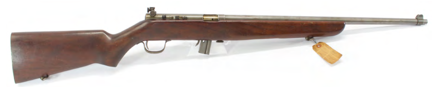
Figure 24. Prototype to the Model 65, serial number "F." This is the rifle used to evaluate the Model 65 design, and is referenced in later H&R promotional material, indicating it had over 144,000 rounds fired through it during acceptance testing by the USMC. The tag on it indicates it had over 100,000 rounds fired through it, with about 80,000 by the Marines and 20,000 by H&R. We'll never know the exact round count, but it's certainly had a lot of rounds fired through it.

as it is the single rifle whose evaluation determined the USMC's decision to adopt the Reising Model 65 as their .22 trainer for the M1 Garand.