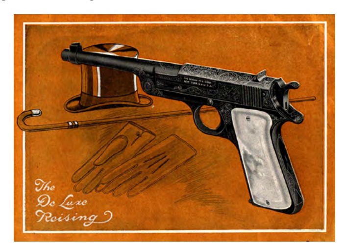
Figure 8. The "Deluxe" Reising was a last minute attempt to market a high end, engraved and pearl handled version of the .22 pistol in a special case with accessories.

In 1925, a "Deluxe" version of the Reising .22 pistol was offered by the Reising Manufacturing Corp. The Deluxe model featured fine engraving, checkered trigger and hammer, pearl grips, an extra magazine, deluxe cleaning rod, and a special leather covered, plush lined case. For these features, a premium of $52 above the normal pistol price was paid, for a total of $85. A very nice, gold colored pamphlet was produced to advertise this special Reising pistol edition (Figure 8).