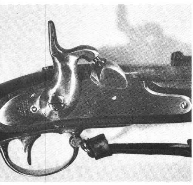
Figure 4 Cone alteration of an 1816 musket