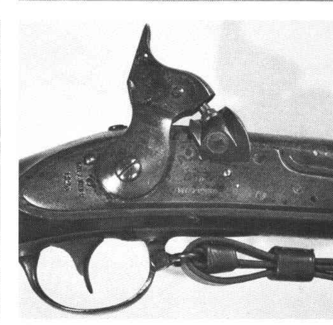
Figure 9 Ward Primer alteration of an 1816 musket

Most of these conversions, particularly the first two types, were reissued during the 50's and early 60's to troops with their original bayonets. There were, however, new bayonets made on the contract with H&P and with the mechanical primer systems, you will occasionally see a new bayonet. There is no doubt but what the standard percussion cap conversions were widely used during the hostilities of 1860 as evidenced by original parts for these muskets being among the battle field relics that are seen today.