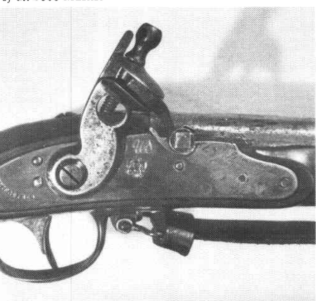
Figure 1 Flint hammer striker conversion of an 1808 Musket