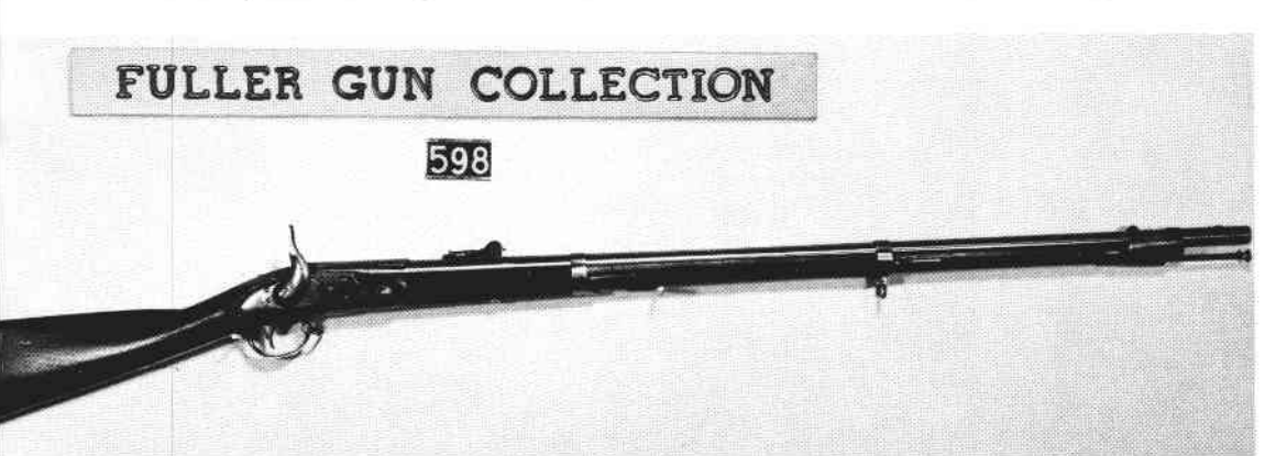
Figure 10 Morse conversion system. Fuller Gun Collection.

In closing, let me say this: let us remember that neither the U.S. Government, at either of its Armories, nor any of its contractors have ever made a reconversion. When you are dealing with a converted flint-lock musket, you are dealing with a historical item that has been considered serviceable on at least two occasions. When you are dealing with a reconversion, you are dealing with an item whose historical significance has been greatly reduced. In closing, let me ask you all to help stamp out "reconversion".