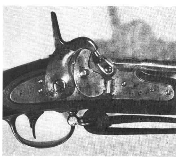
Figure 8 Remington Maynard conversion (second type) of an 1816 musket.