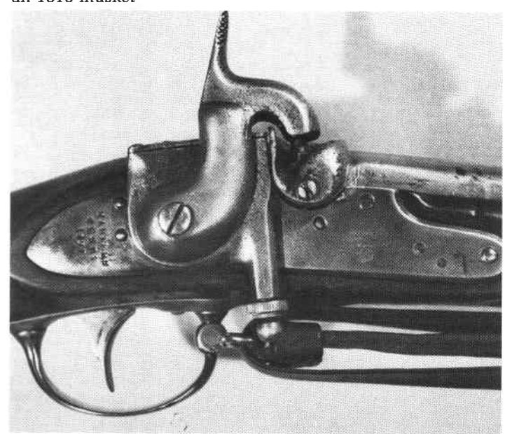
Figure 6 Butterfield alteration of an 1816 musket