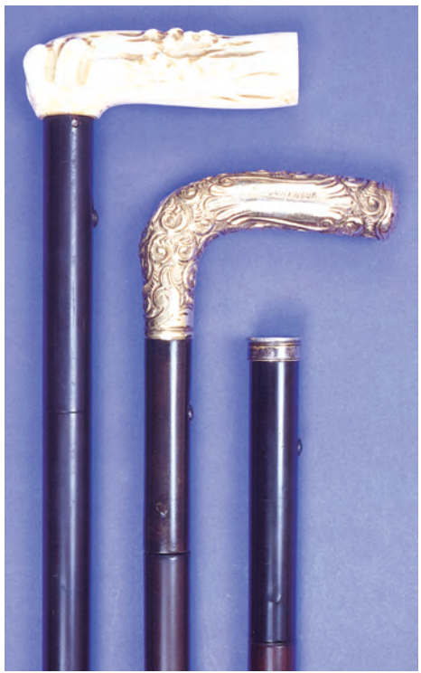
Figure 9. Different types of period after market (replaced) handles.

cane. A retaining sear that also served as a rear sight would pop up from the shaft of the handle and hold the rifle cane handle in a cocked position. This prevented the handle from moving in a forward motion. This procedure would then expose a percussion cap nipple at the breech so a percussion cap could be seated. The rifle cane was now ready to be fired. All the shooter had to do was aim and press the button trigger on the underside of the cane's handle shaft. Should the shooter desire not to fire the cane after it had been loaded and cocked, all he would have to do is release the