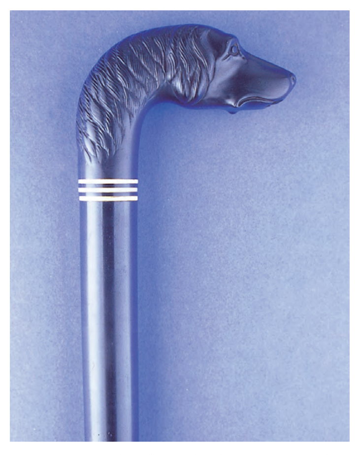
Figure 22. Gutta purcha walking stick with a Remington dog's head handle.

If my assumptions are anywhere near correct, the increased number of Remington rifle canes that were manufactured (a total of 4,500 over a 30 year period) still does not detract from the rarity and value of these guns. Many have been destroyed or ruined by natural disasters and carelessness of their owners.