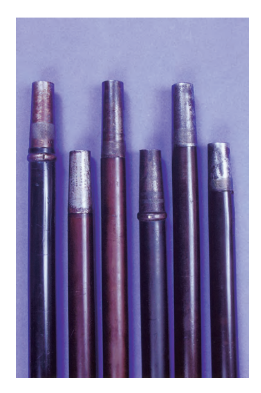
Figure 18. Comparison of the different styles of ferrules.