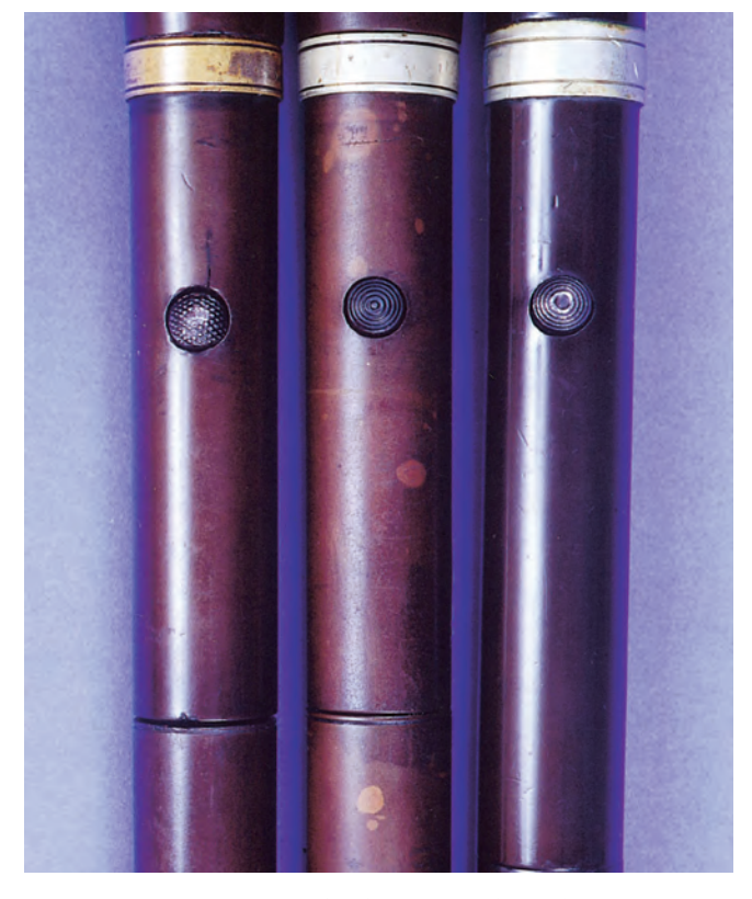
Figure 17. Comparison of the different styles of button triggers.

Mix the resin and curing agent (about 50/50) along with an artist's oil of appropriate color. (Vern found that Grumbacher artist oils work quite well.) If you are filling in a crack, apply the epoxy mixture very carefully along the crack and clamp the pieces together as required. Be careful not to over apply the epoxy. It can be a real mess to work with. Also, be especially careful when applying pressure to the clamp—the gutta purcha is quite thin, especially around the trigger housing. If you have a missing piece of gutta purcha, Vern suggest that a dam or mold may be required to contain the epoxy mixture being applied.