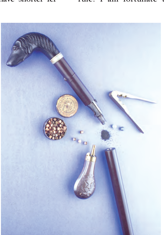
Figure 13. Loading the .31 percussion rifle cane.

pile enough data to make a definitive evaluation as to the chronological order of these ferrules, but at first glance it seems that the percussion model rifle canes have shorter fer-