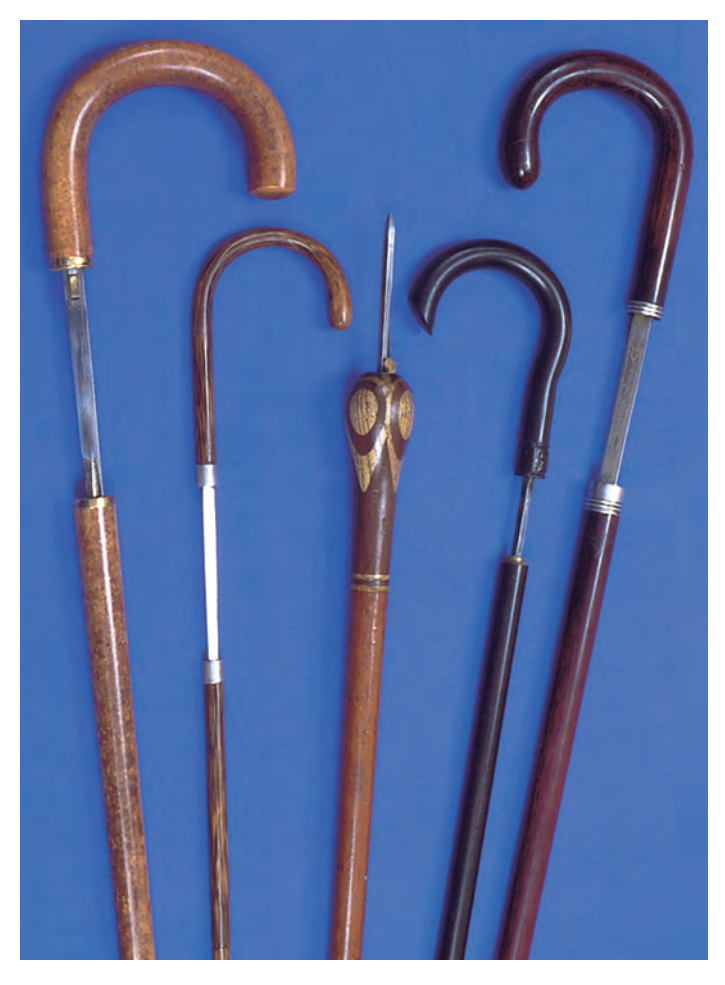
Figure 1. Assortment of sword canes with a "flicker" cane in the center.

all steel canes that were available (i.e., the Day's Patent Cane). It weighed from 16 to 24 ounces, looked more like a true gentleman's cane, was less cumbersome, and was not as obvious as were the other cane guns that were on the market at that time. It was also covered with a thin hard rubber coating know as gutta purcha.