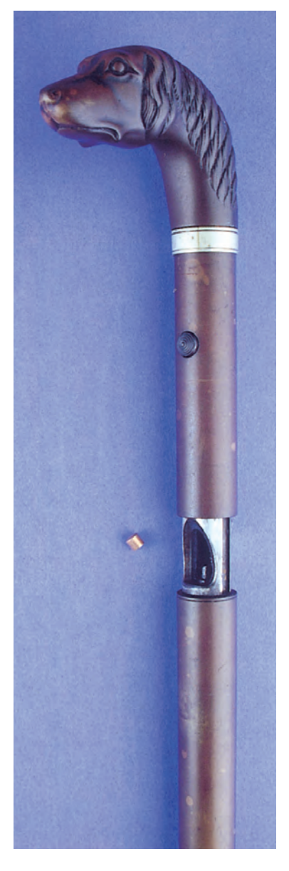
Figure 14. Percussion action.