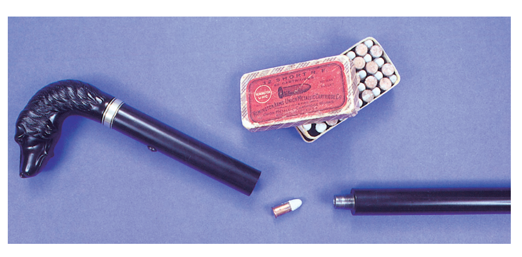
Figure 15. Loading the .32 rf cartridge rifle cane.