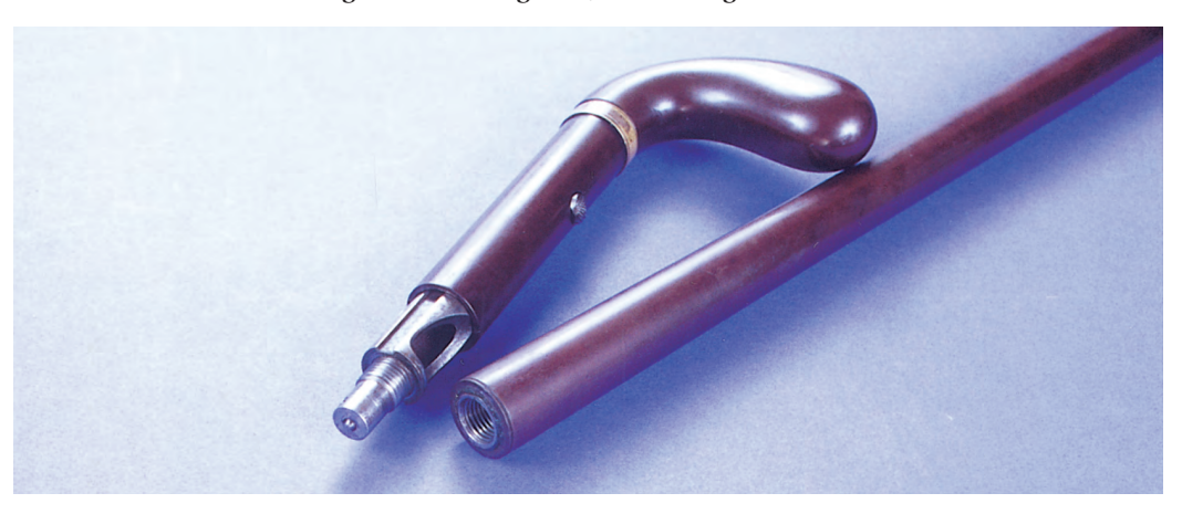
Figure 16. Remington rifle cane converted to .32 center fire.

Then there is the "Remington Cane" that is not a gun. This is a dark brown gutta purcha dog's head walking stick that looks identical