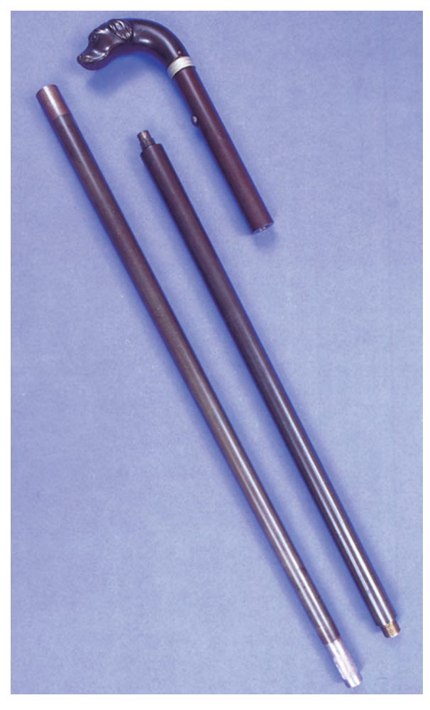
Figure 21. Very rare Remington .22 rf dog's head "take down" rifle cane.

Any cane gun is a very unique and collectable oddity. The fact that relatively few are encountered gives testimony to their rarity. Of the cane guns that were manufac-