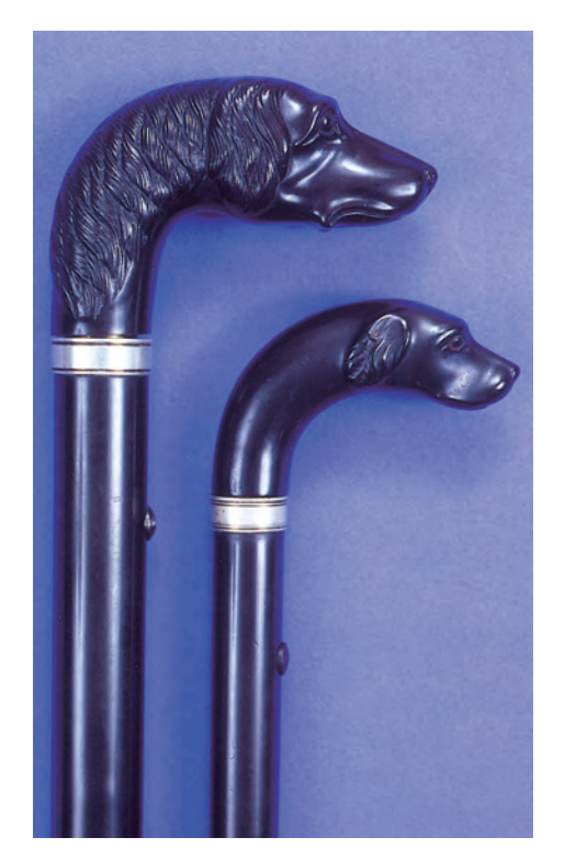
Figure 8. Comparison of large dog's head and small dog's head handles.