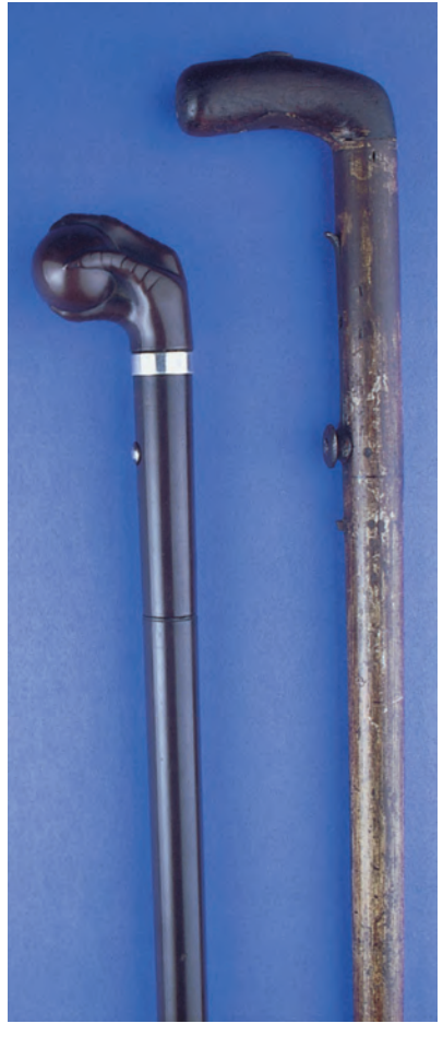
Figure 4. Remington rifle cane with ball and claw handle and Day's Patent cane gun.

Serial numbers can also be found on the upper part of the barrel shaft where it meets the handle shaft; they may also be found on some of the ferrules, especially