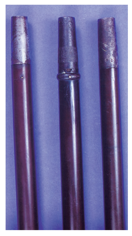
Figure 19. Different types of front sights.