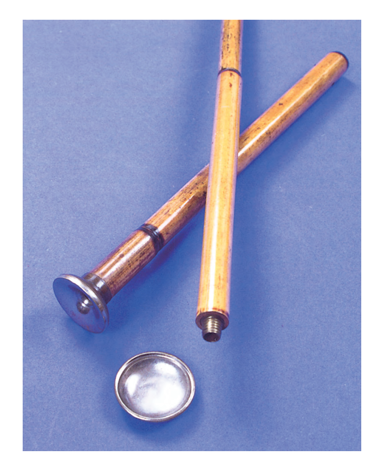
Figure 2. Blow gun cane.

It appears that each of the models were given a serial number range of their own, beginning with the number "1". I have included the conversion models under the percussion model category, because they started out as percussion mod-