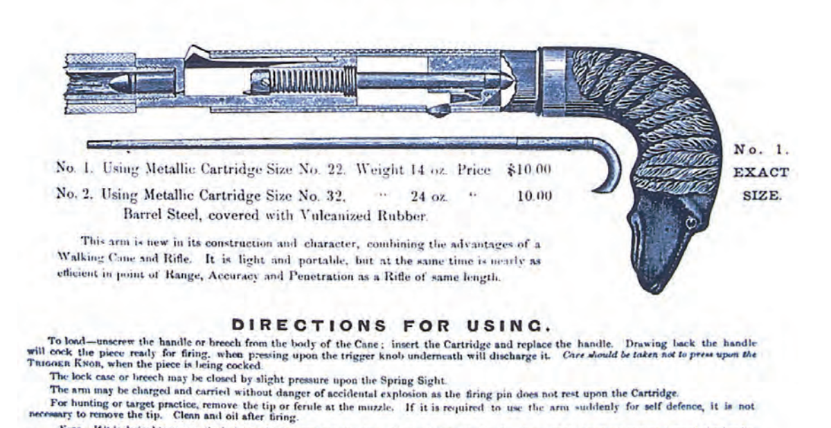
Figure 5. Remington rifle cane advertisement showing internal mechanism for rim fire cartridges.

Note. If it is desired to remove the lock case for any purpose, slip down the ferule from the bandle; drive out the small pin passing through the bandle, with the Lock Case, can be removed