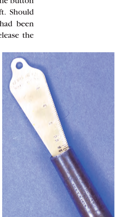
Figure 10. Caliber gauge inserted into cane muzzle.

I have examined several Remington percussion rifle canes that have been converted to .32 center fire. All of these conversions were done in the same manner and configuration demonstrating the same very professional workmanship.