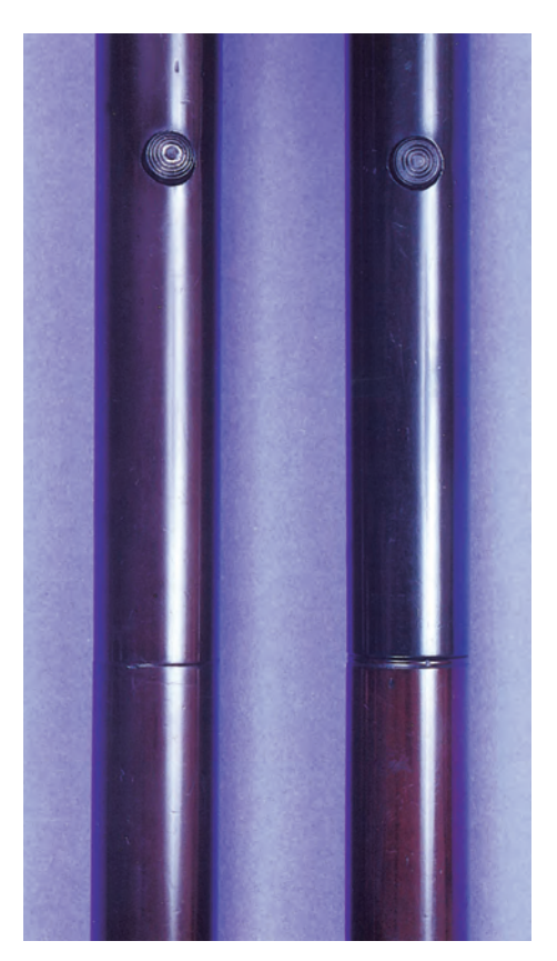
Figure 11. Comparison of cane shafts with and without indented ring.

models. It appears that the same gutta purcha mold that was used on the percussion models was carried over to a very few (less than 100) early cartridge canes. The later .32 rim fire canes do not have this indented ring.