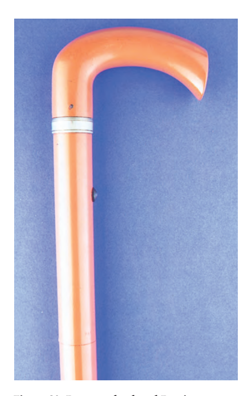
Figure 20. Rare coral colored Remington rifle cane.

The curing time for the epoxy depends on the temperature. The resin should be no less than 60 degrees. The curing time at that temperature will take several hours. At 150 degrees you can expect a curing time of one hour or less. After the epoxy has cured, you will need to sand with a very fine paper (400 grit or finer). Be very careful not to over sand and be especially careful of the surrounding areas.