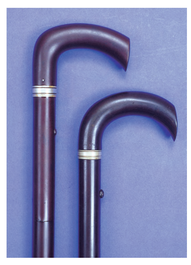
Figure 7. Comparison of long shaft and short shaft handles.

When Remington received their 1872 patent extention, they marked their canes accordingly.