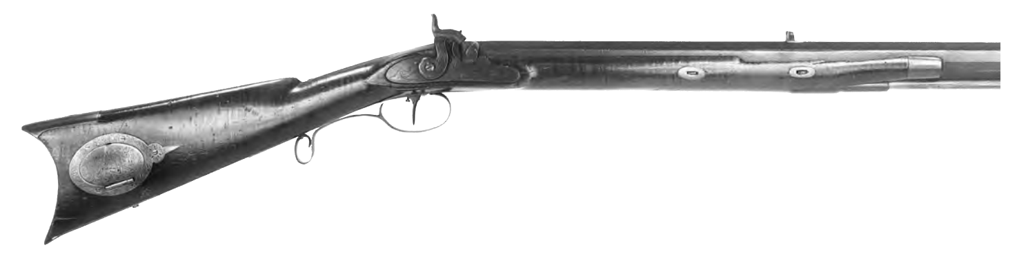
Figure 10. Three quarter view of the right side. Note the slivers missing from the fore end, and the expansion of the wrist from front to back.