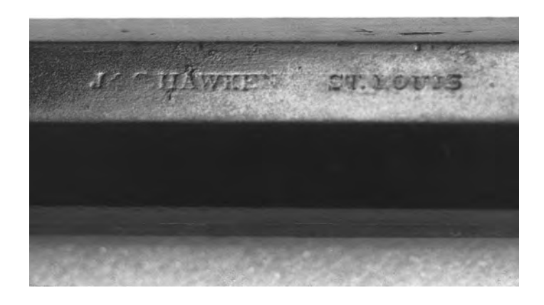
Figure 3. The name on the barrel: J & S. HAWKEN ST. LOUIS, a mark in use from 1825 to 1849. A heavy coat of varnish on the barrel may explain at least in part the apparent lack of full lettering.