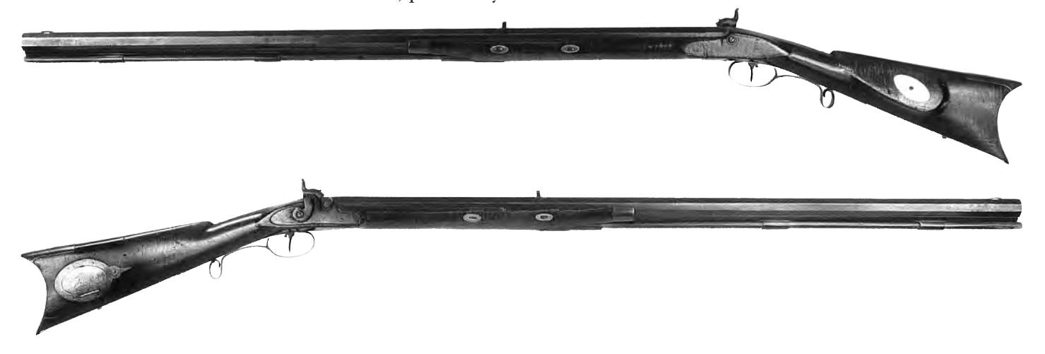
Figure 1. The Sublette-Beale Hawken rifle overall views of left side and right side.

Although an early hunch suggested that the name Sudlet was probably an error in transcription, efforts were made to determine if it could be a correct and plausible entry. None of the biographical works on Beale himself refer to the name Sudlet, and a search of the standard printed references, and quite a few non-standard ones, found no entries for Sudlet, past or present. A search using several people-finders on the Internet found no one with the surname Sudlet in the current directories of the U.S., nor were there any entries for a Sudlet in the many on-line sites concerned with California Pioneers, where Beale would most likely have encountered a pioneer with that name. The search engine "Google," which covers everything from current to