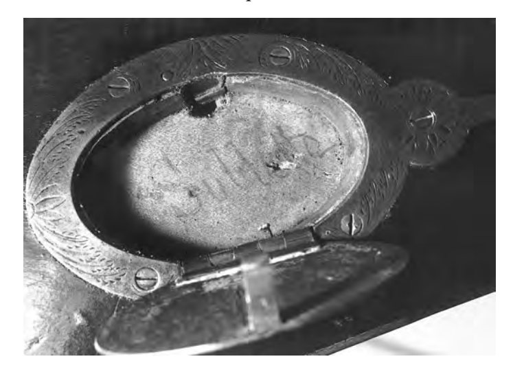
Figure 9. "Sublette" in the patch box, a penciled inscription that was covered over by grunge for a long, long time.