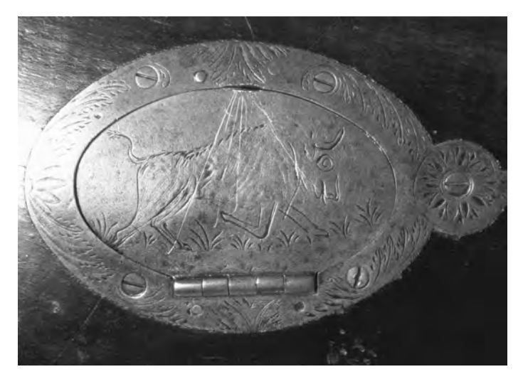
Figure 8. The buffalo on the patch box lid. According to Jerry Gnemi, Hawken Specialist, only three "buffalo" patch boxes are known on Hawken rifles at the present time.

Thus there is uniformity in the time specific features, and uniformity in the vintage of the hardware, with no late features, anomalies or unexplainables. The gun fits perfectly the overall time requirements of the Sublette-Beale experience.