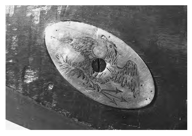
Figure 12. Close up of the eagle-engraved silver oval set into the cheek piece. A professional would have to use a few tiny pins around the edge to hold the oval in place.

In most respects, the Sublette-Beale Hawken is a typical half stocked plains rifle that has seen hard use but is still structurally sound and basically in original condition. "Wear and tear" includes some missing slivers of wood from the right side of the fore end (a point of distinction), and a slight collapse of the wood at the toe of the stock (figure 10).