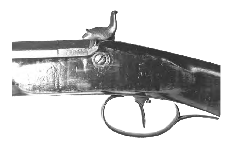
Figure 11. Close up of the left side breech area. Note the "slant breech" surface (just under the nose of the hammer) and the vestige of a flash fence on the tang block just behind it.

A third name on the gun almost falls into the category of graffiti, and though it does not contribute to age dating the gun, the name gains importance when the circumstances of its "discovery" are considered. During my preliminary examination of the gun in 1999, the inside of the patch box was found to be crusted over with a layer of dirt. flaky dried-out grease, and corroded percussion caps. A superficial cleaning with an artist's brush (done primarily to get rid of loose material) revealed the name Sublette, written in pencil and just barely discernable on the bottom of the patch box.<sup>20</sup> To my knowledge, in the few years that this project had been underway, no one connected to the gun was aware of the name. Since then, a thorough cleaning of the patch box by a professional restorer has brought the name out significantly (figure 9). There appears to be no question that the name has been there for a long time, at least before a handful of percussion caps started to corrode and turn to grey powder. Exactly how long that might be I do not know, but the implied age lends fairly conclusive support to the idea that the name in the accession record should have been Sublette, not Sudlet.