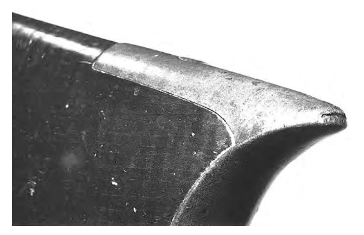
Figure 6. Break and seam in the butt plate heel indicating hand-crafted construction.

Another early feature is the vestige of a flash fence on the upper left flat of the barrel tang block. This remnant-ofa-fence is rarely seen on later guns, which have an upper left flat that extends smoothly from the barrel all the way to the