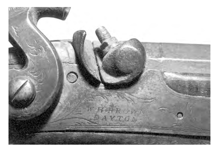
Figure 4. The name on the lock is W. H. BROWN/DAYTON which dates this component from 1827 to 1843. The design of the "snail" around the percussion nipple, which shows some sophistication, shortens this span to about 1835 to 1843, the time frame in which the gun must have been made.