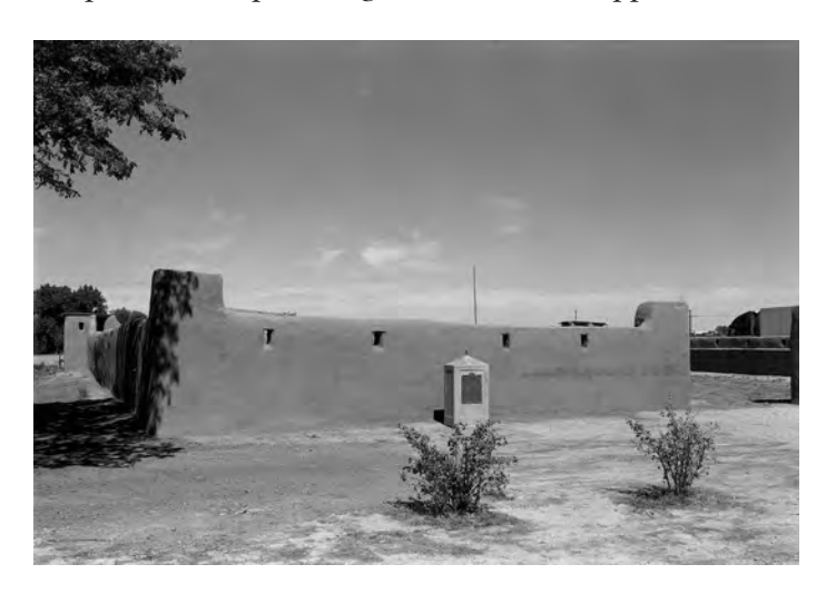
Figure 2. Fort Vasquez, reconstructed onsite about 35 miles northeast of Denver, Colorado. Owned and operated by the Colorado Historical Society, this property includes a well appointed Museum.

Within a few years after the founding of Fort Vasquez, the press of competition gave rise to three opposition trad-