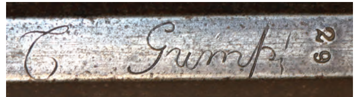
Figure 20. Maker's signature.

US Marking. The US on the Gonter rifle and Gumpf barrel appear to be from the same stamp (Figure 21). The US on the Henry appears to be from a different stamp. The Lancaster area makers could easily use the same stamp for marking US on their rifles. While not mentioned in the correspondence, this practice would have been in keeping with the 1792 rifle marking. The makers would have stamped the US, as they did not want any to disappear on the way to Schuylkill Arsenal.