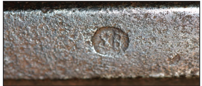
Figure 19. Barrel makers mark.