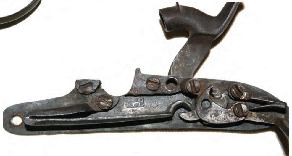
Figure 10. Interior view of Gonter 1807 rifle lock showing the typical initials found on imported European locks.