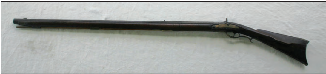
Figure 8. Cheek piece side of the Peter Gonter contract rifle.