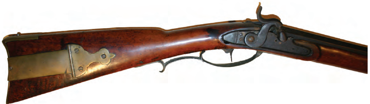
Figure 2. 1792 contract rifle by John Demuth.

The barrel now measures 41-5/16 inches overall. The barrel was shortened at the breech end when it was converted from the flintlock configuration to percussion. In this example (Figure 2), the conversion process consisted of cutting the barrel off just in front of the touch hole, reinstalling the breech plug and adding the percussion nipple. The barrel originally had a groove cut in the bottom to clear the front lock screw and a new groove was cut in the same manner to clear the screw in the restocking. The space between the two grooves is exactly 3/4 of an inch. When this 3/4 inch is added to the present length, the result is 42-1/16 inches for the original length. The length specified in the 1792 letter from Henry Knox to General Hand was 42 inches. This one-sixteenth inch difference is certainly within the measurement tolerances of the period. The barrel is typical of the late 18th century production with a long taper from the breech, which flares out again at the muzzle. At the breech it is 0.98 inches in diameter, decreasing to 0.815 inches in diameter at 5.5 inches from the muzzle and flaring to 0.9 inches in diameter at the muzzle. The present interior of the bore is worn to the point that it is about .55 caliber at the muzzle.