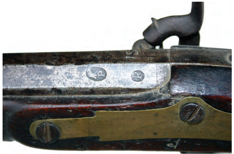
Figure 11. Gonter rifle with two proof marks.

maybe one of the guns that Wickham proved over again in 1811 as he would have needed some way to account for barrels that he reproved. There is at least one other example known with two proof marks. The eagle over P proof mark that is normally encountered is the same stamp found on 1807 contract pistols. Wickham may have put on the plain P proof mark in order to keep track of which ones he reproved.