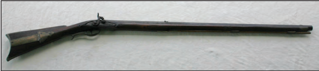
Figure 7. 1807 contract rifle by Peter Gonter. The barrel length is 37-3/4 inches with an overall length of 53 inches.

The Gonter barrel as shown has two P proof marks instead of the single mark on the other examples. This