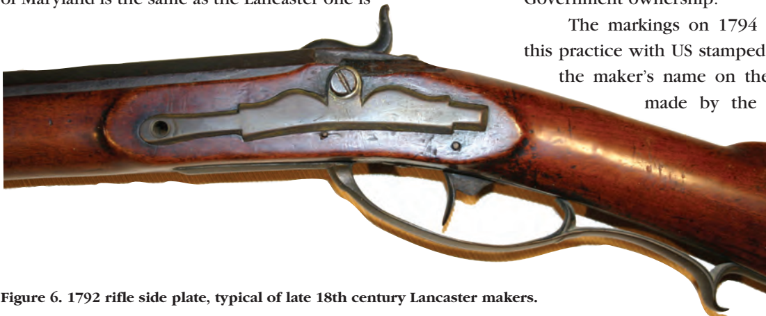
Figure 6. 1792 rifle side plate, typical of late 18th century Lancaster makers.

The markings on 1794 contract muskets confirm to this practice with US stamped on the rear of the barrel and the maker's name on the lock. Since the locks were made by the musket contractors or purchased from local lock makers, the maker's name and US could be put on before the lock was hardened. In both the musket and rifles, the barrel would have been