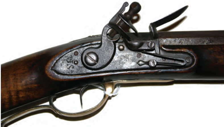
Figure 16. Original flintlock marked US in the Brenise rifle. Since the lock is stamped US on the tail, it is probably not an imported lock. There is at least one other rifle known with the same type of US marked lock.

This George Brenise rifle (Figures 15-17) was also restocked about 1830 using all of the original rifle hardware. When restocked, the two side plates were added to the patch box. They would not have been on the original and are also a different color.