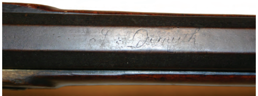
Figure 4. John Demuth signature on the 1792 barrel.

original side plate was retained. A pin was inserted into the lock forward of the original screw hole for the main spring to replace the retaining screw. The end of the main spring was hooked on this pin and a new hole was drilled in the plate for the original retaining pin on the spring. The repair was probably done in the 19th century when the original parts had worn or broken to where the lock would not function. While it is impossible to accurately estimate when this last lock modification or repair was accomplished, it appears that the rifle has not been used for many years. The extent and method of the repair is beyond the typical cosmetic repairing done by collectors for appearance sake.