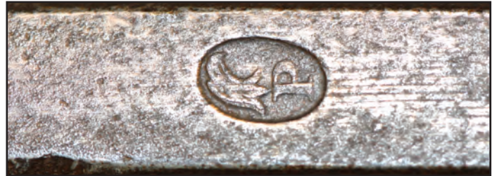
Figure 18. Proof mark.

The SB mark is relatively common on Kentucky rifles in general and also 1807 contract rifles.