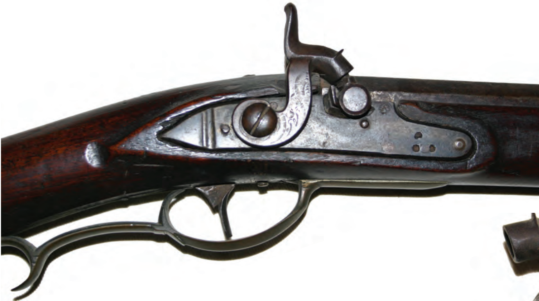
Figure 9. Lock on the P. Gonter contract rifle. A typical imported lock used on most of the 1807 contract rifles which has been converted to percussion.