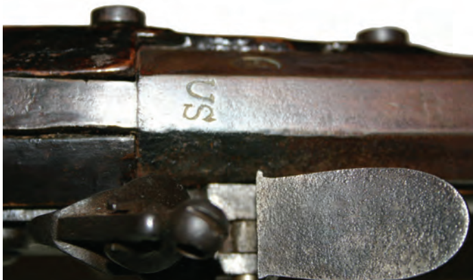
Figure 17. The Brenise rifle is marked identically to the Gonter and Henry rifles with a P and US at the breech.