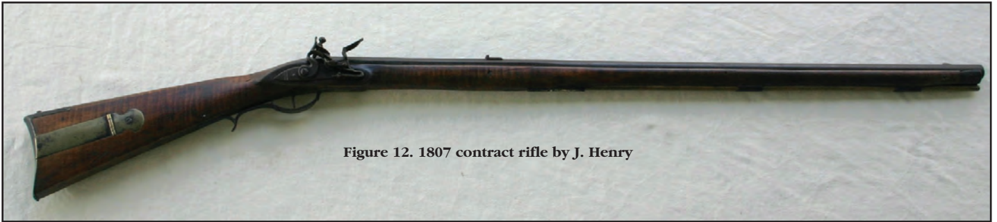
Figure 12. 1807 contract rifle by J. Henry

The J. Henry rifle (Figures 12-14) is stocked in maple with the markings on the barrel of a single P and US. Henry managed to produce a two piece patch box that used less brass than other known makers as well as a single screw instead of three to fasten the patch box finial.