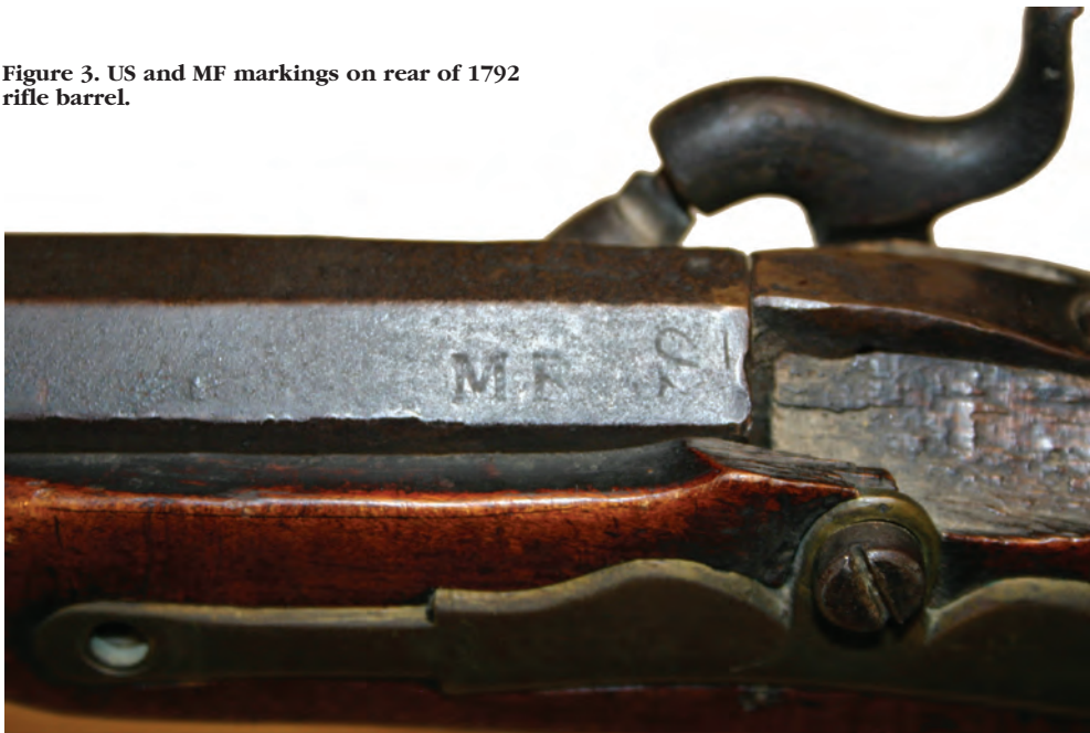
Figure 3. US and MF markings on rear of 1792 rifle barrel.