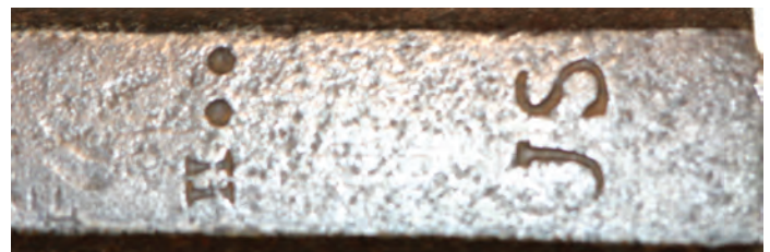
Figure 21. US marking.

US Marking. The US on the Gonter rifle and Gumpf barrel appear to be from the same stamp (Figure 21). The US on the Henry appears to be from a different stamp. The Lancaster area makers could easily use the same stamp for marking US on their rifles. While not mentioned in the correspondence, this practice would have been in keeping with the 1792 rifle marking. The makers would have stamped the US, as they did not want any to disappear on the way to Schuylkill Arsenal.