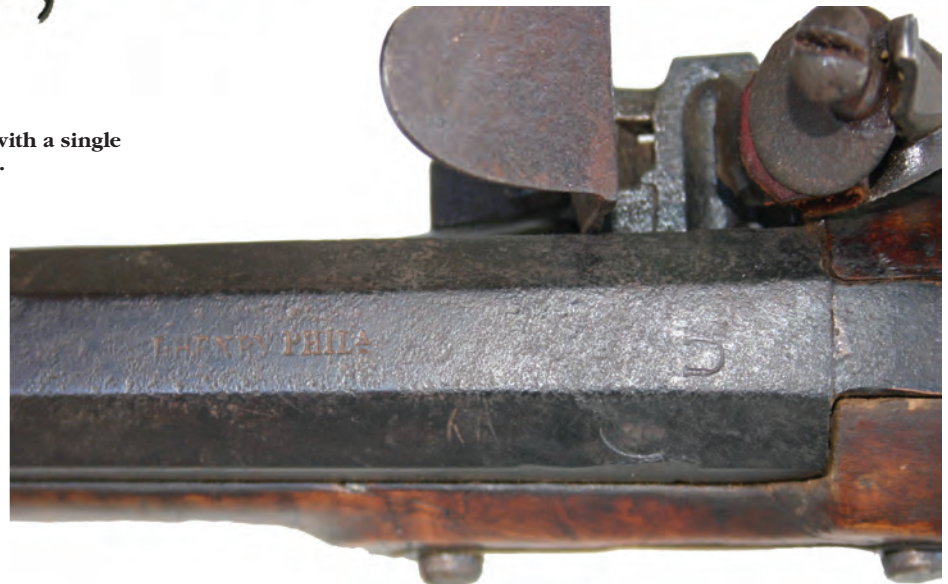
Figure 14. J. Henry's name, US mark and proof mark on barrel of 1807 contract rifle.