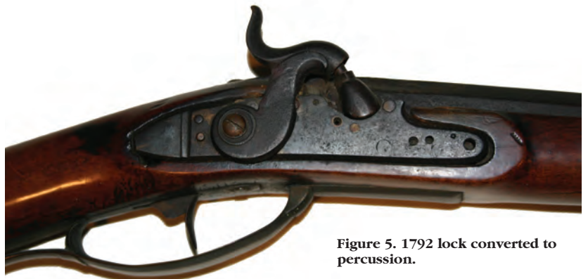
Figure 5. 1792 lock converted to percussion.