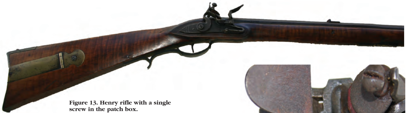
Figure 13. Henry rifle with a single screw in the patch box.