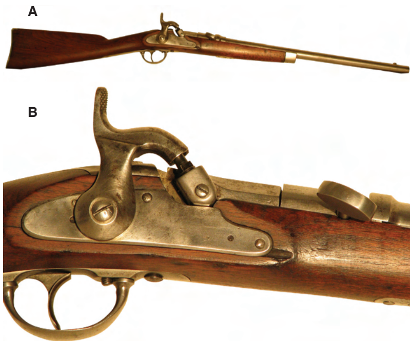
Figure 3. First Model Type Ib with plain latch.