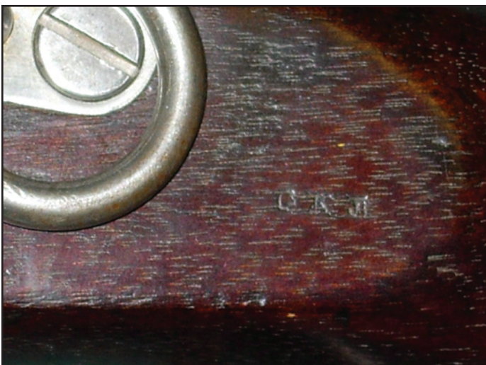
Figure 6. M1861 Type I Lindner "GKJ" Inspector's Marking.

Markings on this First Model 1861, or Type I, carbine are typical of the period. The breechblock is marked "Edward Lindner's/Patent/March 29, 1859" in three lines (See Figure 5). It reads from the right side on some pieces and the left on others. The lock is unmarked, except for single or double-digit numbers stamped inside on the tumbler bridge and/or hammer. Certain major parts of individual carbines have been found marked with "///" assembly marks, indicative of parts lots controlled for dimensional fit—a typical practice of that time. The inspector's mark "GKJ", in block letters adjacent to the sling ring, stands for George K. Jacobs (see Figure 6). A small "J" will normally appear on the rear of the barrel, immediately in front of the locking collar.