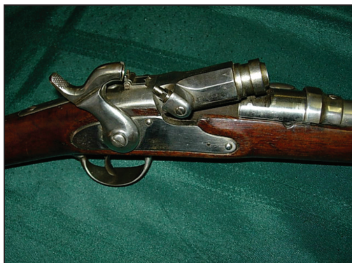
Figure 4. Type I Carbine with Breechblock in open position (Photo courtesy Antiqueguns.com).

to tip upward for loading (Figure 4). Once loaded, the breechblock is snapped down and the collar is rotated clockwise to secure it into place. The unique feature of this breechblock is that Lindner solved the problem of effectively containing the firing gasses. A beveled lip at the front of the