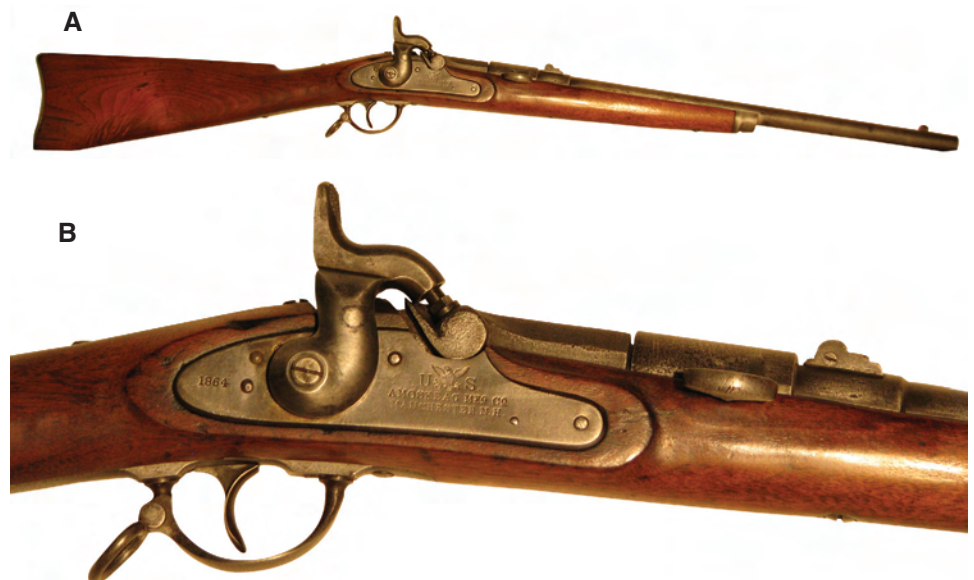
Figure 7. Type II Lindner Carbine, note sling ring at rear of trigger bow.

But what of the 6,000 carbines? They were sold to the French on November 12, 1870 "to an agent of the French government" (Supreme Court of New Hampshire). According to Jean Beaudrieu's American Arms of National Defense 1870-71 , the French determined these now 5,999 carbines to be "too dangerous" for their use and auctioned them at Bayonne in 1873 (Moller). Many of these carbines later appeared on the surplus market, with Francis Bannerman Sons, Inc. offering them for $10.00 each in their 1927 catalog (Bannerman, 71).