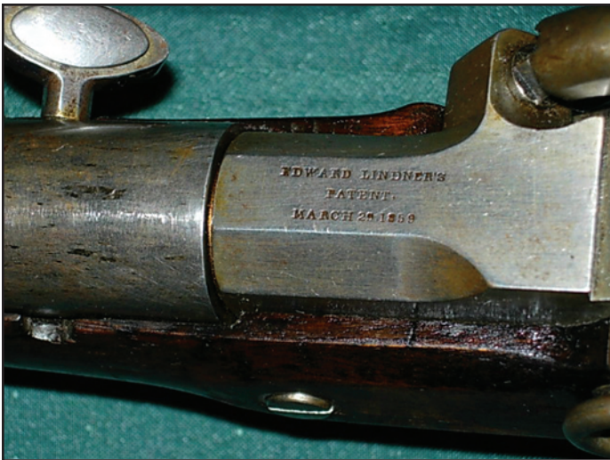
Figure 5. Breechblock marking on M1861 Type I Lindner Carbine.

breechblock engages a chamfer at the rear of the barrel. Because it is threaded, the collar pulls the breechblock forward on closing to engage the barrel chamfer. Few other breechloaders of Lindner's era were that effective.