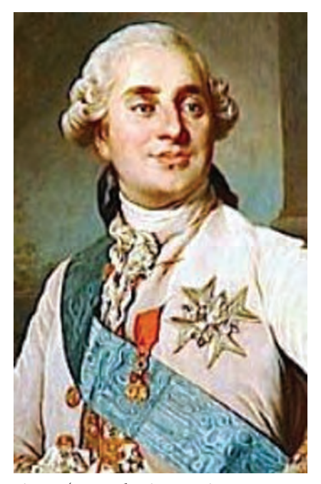
Figure 4. French King, Louis XVI.

1776, Silas Deane arrived in Paris, France. He set up residence in a hotel and in a week's time, on July 11<sup>th</sup> began discussions with the Comte de Vergennes regarding French aid for arms and equipment for the military supplies needed by America. Vergennes stressed to Deane that the French government could not officially endorse the new united American colonies or openly supply them with