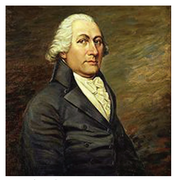
Figure 9. John Langdon.

Benjamin Franklin (Figure 8) arrived in Paris the third week of December 1776. Silas Deane met with Franklin and told him of the signed agreement for aid with Beaumarchais and also discussed the responsibility that America had for repayment with goods from the American colonies. The goods from America (tobacco and cotton) would be shipped to France on the return trip of the ships bringing military aid to America. At this meeting, Franklin indicated to Silas Deane and Arthur Lee that they, like himself, had been appointed American Commissioners of Trade with France by the Continental Congress. This appointment gave them official status in their endeavors to secure additional military aid and financial support to the American war effort. As American Commissioners, they stood to gain financially by commissioning war goods sent to France from America in exchange for the arms and equipment sent from France. Final arrangements were made with the Comte de Vergennes and Beaumarchais to send the cannon, fusils, gunpowder and other goods to America.