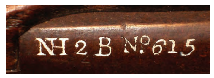
Figure 13. New Hampshire 2<sup>nd</sup> Battalion Musket Markings.