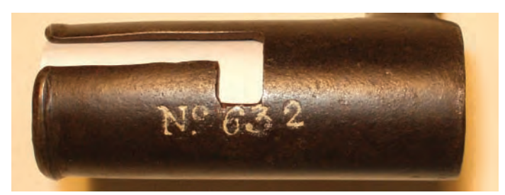
Figure 16. New Hampshire Markings on Socket of Modified French Model 1771 Bayonet.