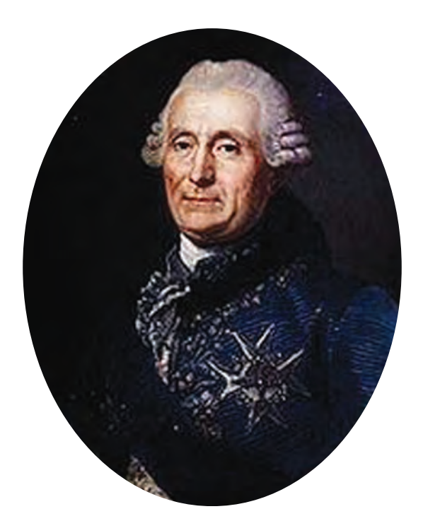
Figure 5. The Comte de Vergennes.

aid. The Comte de Vergennes advised Beaumarchais to meet with Silas Deane. On July 13th, Beaumarchais met with Silas Deane's agent, Dr. Dubourg. At this meeting Dubourg learned of Beaumarchais' proposal for one million livres in aid from Louis XVI to support the purchase of supplies in support of the American Revolution. Louis XVI was promised repayment of this loan in the form of tobacco and cotton