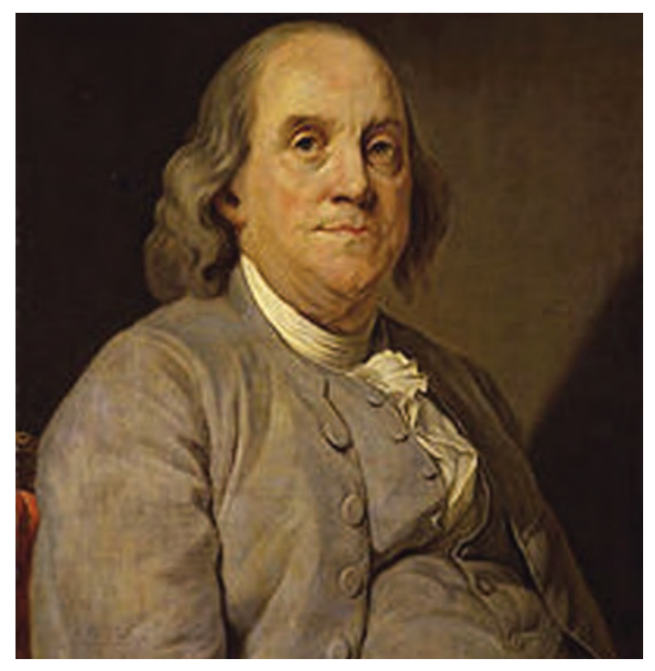
Figure 8. Benjamin Franklin.

building, the Hotel de Hollande. In addition, Roderique Hortalez and Company had a secondary office in Le Havre, France. This office in Le Havre was the financial exchange house which gave the cover of false documents for the French shipments of arms, munitions and supplies to America. Beaumarchais' initial agreement with Silas Deane was signed in mid-October of 1776. This agreement provided for the shipment of 200 brass 4 lb. cannon, 30,000 fusils, 100 tons of powder and items such as bayonets, clothing and other supplies for the American military.