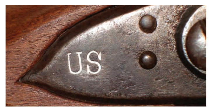
Figure 19. US Surcharge Stamp on Rear of Lock.