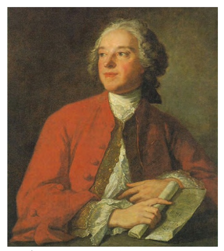
Figure 6. Pierre Caron de Beaumarchais.