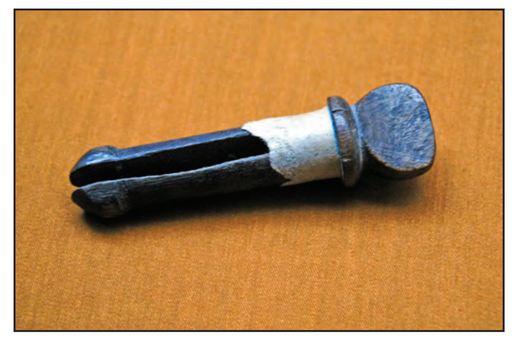
Figure 5b. Revolutionary War tompion.

Figure 6. A contract-style wood canteen of the "Cheese Box" pattern (RKK). This example conforms to other known examples of the cheese box construction with period carved markings or documentation to the American Revolution. In addition, most of the examples examined by the authors have wire loops to hold a rope cord rather than flat leather loops constructed to retain a leather strap. The 18<sup>th</sup> century examples are made with thicker wood components than the more common 19<sup>th</sup> century patterns.