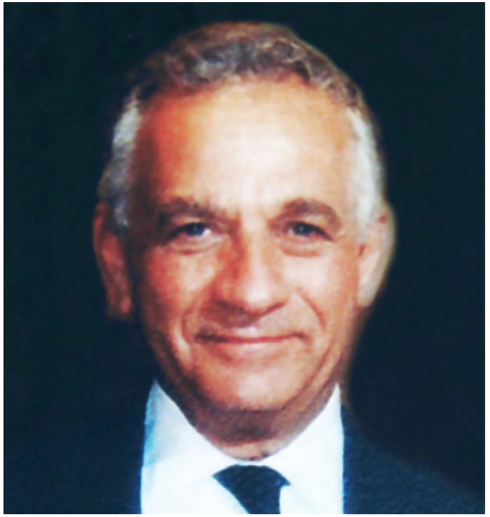
Figure 7. Norm Flayderman, known as the Dean of Antique Gun Collecting.