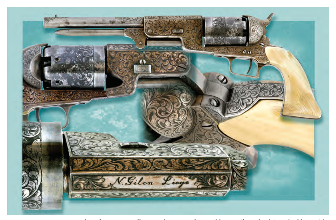
Figure 9. Presentation grade Colt Brevete Walker revolver manufactured by N. Gilon of Belgium (Bobby Smith Collection).