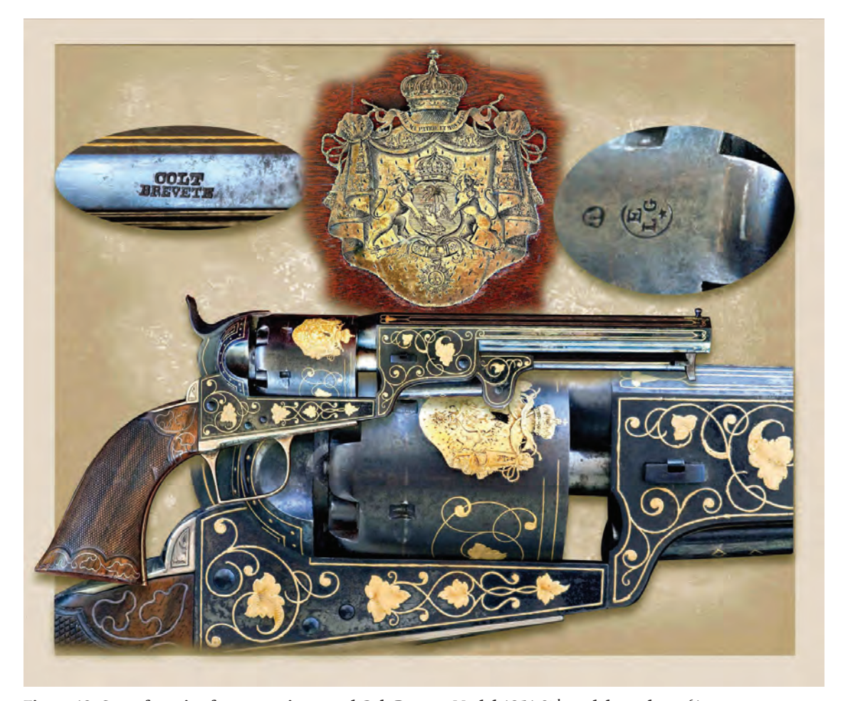
Figure 13. One of a pair of presentation cased Colt Brevete Model 1851 2^{\rm nd} model revolvers (Anonymous collection).