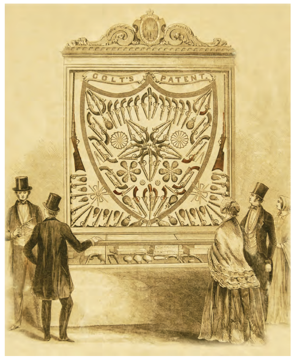
Figure 3. Samuel Colt had a prominent display of more than 400 firearms at London's Great Exhibition in 1851. His revolvers soon became the most sought-after pistols in England and on the Continent.

terfeit revolvers were unmarked, with no definitive way of knowing which shop made the firearm. And lastly, should the infringer be found out, in all probability they were of very limited means and had little to give up if Colt embarked upon a lengthy and expensive patent lawsuit. Samuel Colt was in a very difficult business situation.