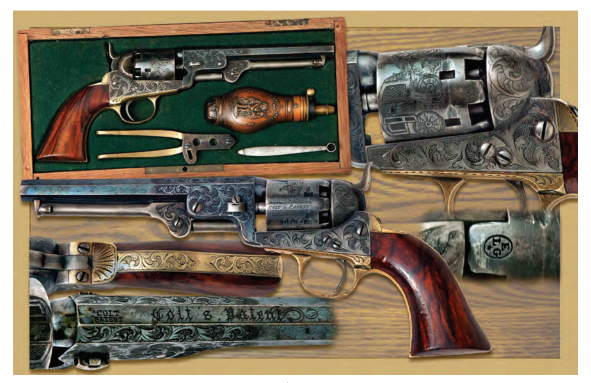
Figure 12. Engraved and cased Colt Brevete Model 1849 revolver manufactured in Liege, Belgium (William Myers Collection).