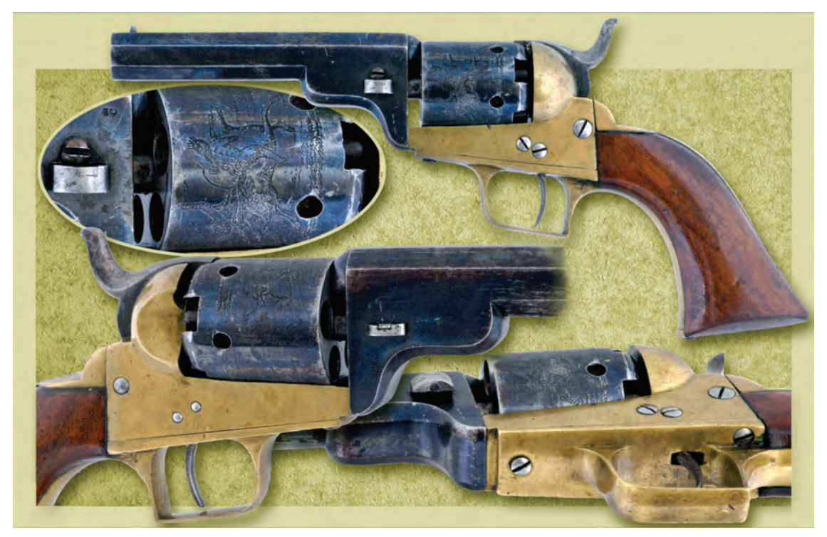
Figure 11. Colt Brevete "Baby Dragoon" revolver with brass frame (Henry Stewart Collection, VMI Museum).