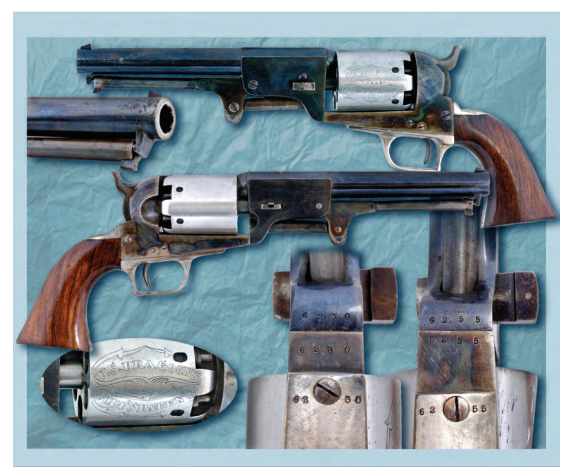
Figure 10. Cased pair of Colt Brevete 1st model Dragoon revolvers (Henry Stewart Collection, VMI Museum).