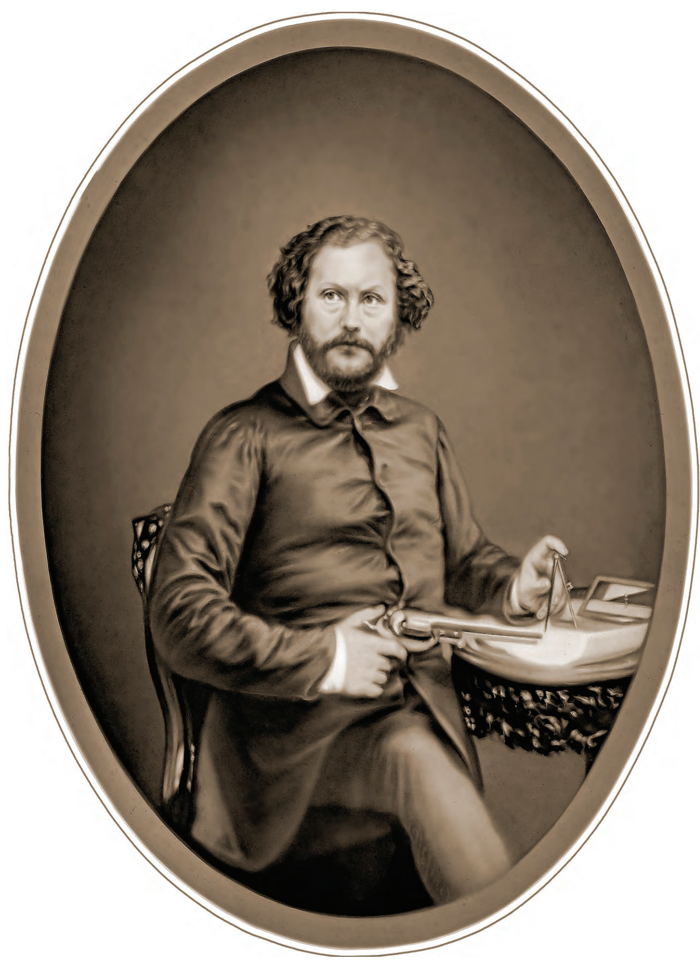
Figure 1. Lithopane image of Samuel Colt.