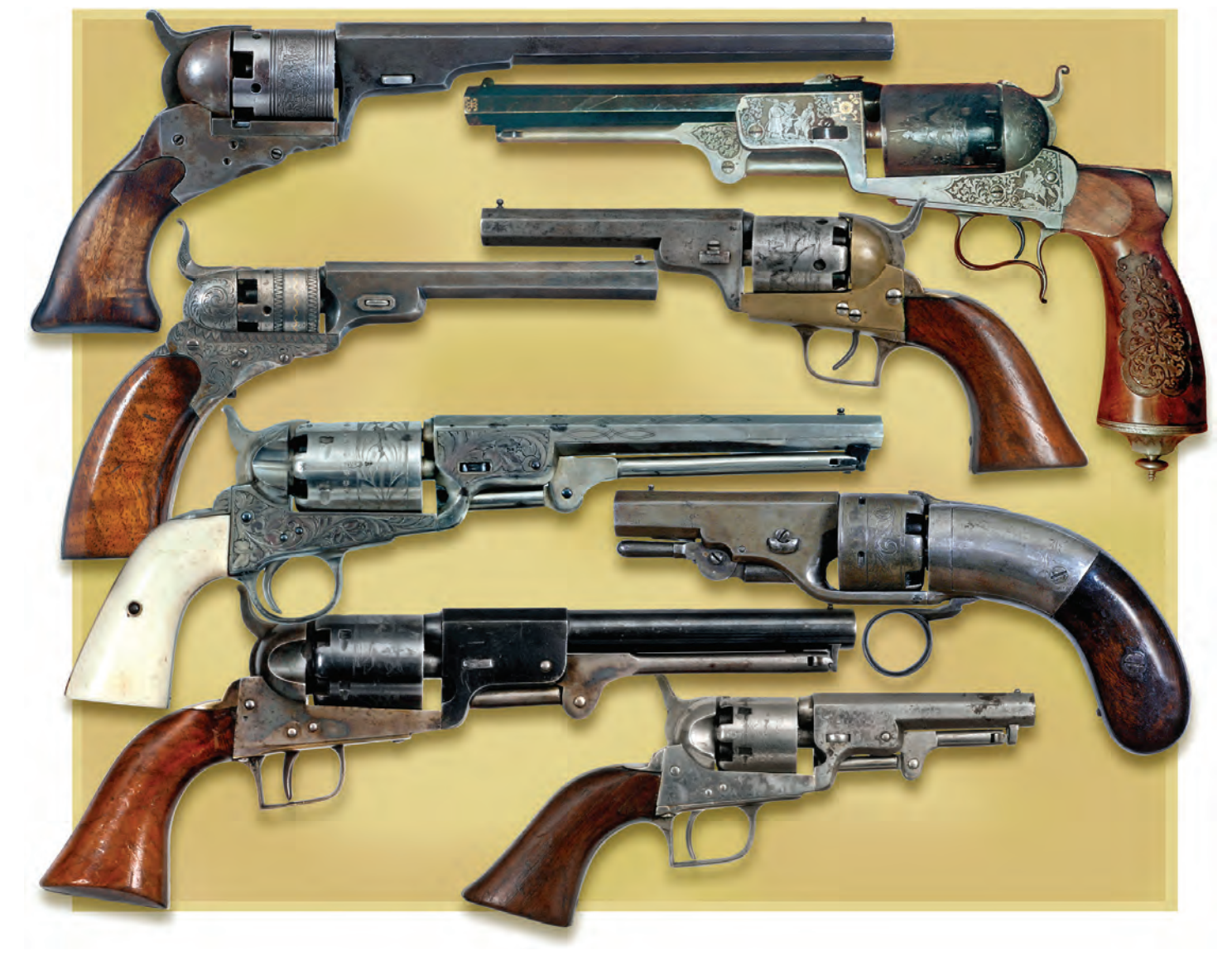
Figure 2. A sampling of different Colt Brevete revolvers.

work would not pass the Colt inspector's examination, and the arms would be confiscated. Lastly, these "authorized" Colt copies could not be exported to the United States.