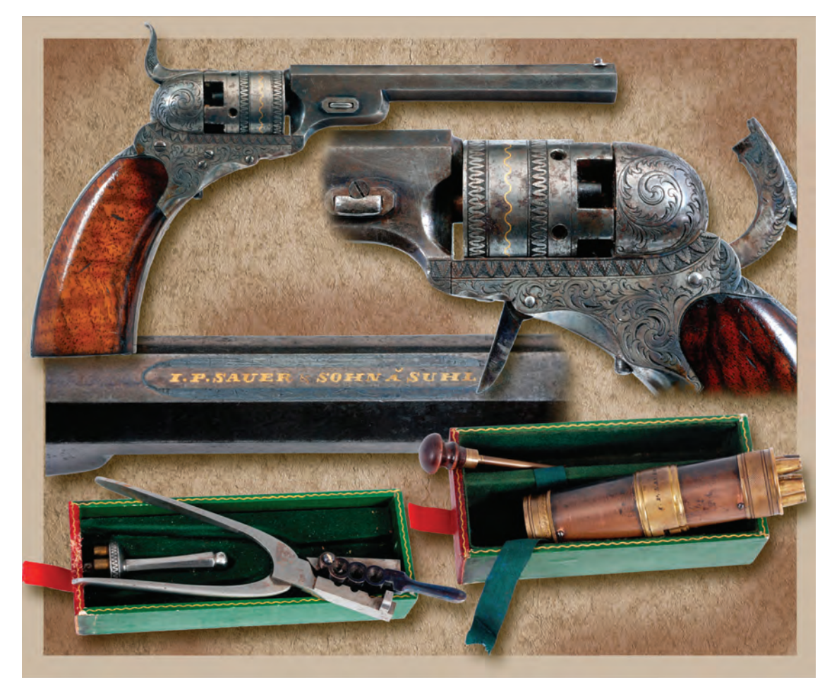
Figure 8. Colt Brevete "Belt Model" Paterson revolver, made in Suhl, Germany (from the Dennis Levett Collection).