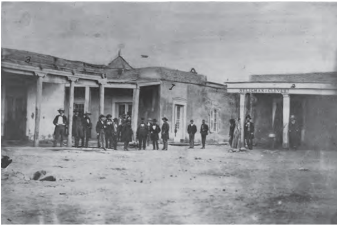
Figure 2. The Seligman and Clever Trading Post.

In about 1851, Sigmund also owned a business as a daguerreotype photographer, with a small studio on the Santa Fe plaza. He was associated with William Messervy, who became acting governor of the territory in 1854 (Figure 4). The photo of Messervy in Figure 4 shows his first or second model square back trigger guard, 1851 Colt revolver in his belt. He looks like the sort of governor we could use today. Sigmund's brother Bernard served as a captain and