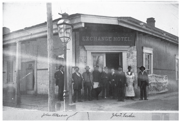
Figure 3. The Exchange Hotel.

quartermaster in the Union Army during the Civil War Battle of Valverde, NM, in March 1862.