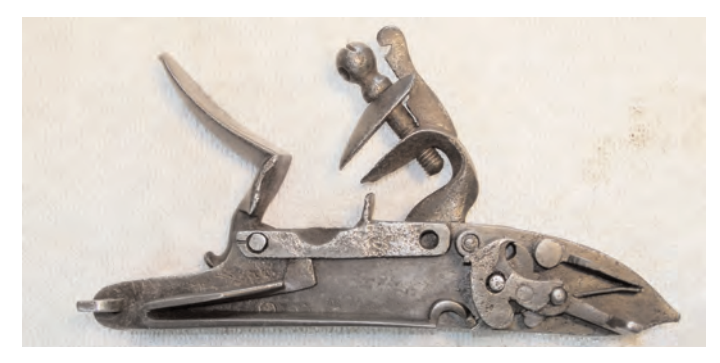
Figure 3. The interior of the lock shows the absence of screws with all parts being hooked into place with pins. The two-piece tumbler bridle can be seen which is rotated into position and held in place by the cock screw which passes through the tumbler and the peg for the sear.