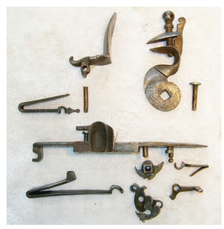
Figure 4. An disassembled view of the lock clearly illustrates the elongated cock screw which passes though the tumbler.

and maintenance of the locks (Figures 3 and 4). He followed the regiment to Cork and traveled to various places where the regiment was stationed to instruct the men, returning on the October 17, 1784. After his return, he was