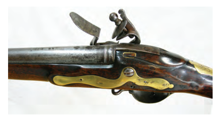
Figure 6. The left-hand side of the musket is shown. The side plate with its forward screw hole brazed over can be seen; also visible are the two iron nails which hold the side plate in position. The single side screw shown was added at a later date when the lock release catch, seen next to the barrel tang, was disabled and plugged.

In addition to the screwless lock, it appears that the lock itself was fixed to the musket without the use of sideplate screws. Currently, the musket illustrated contains a single lock screw with the front of the lock plate retained by a hook. However, close examination shows traces of the original mechanism which allowed for a quick release of the lock. Visible on the top of the musket near the tang is what