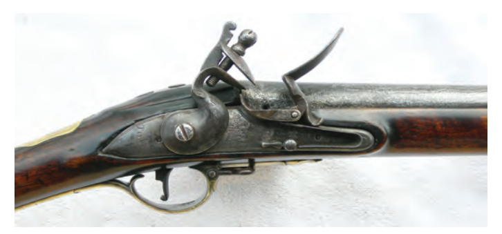
Figure 2. From the exterior, the lock appears little different from the conventional lock. The only obvious differences to be seen are the pin for the frizzen and the peg upon which the frizzen spring hooks.