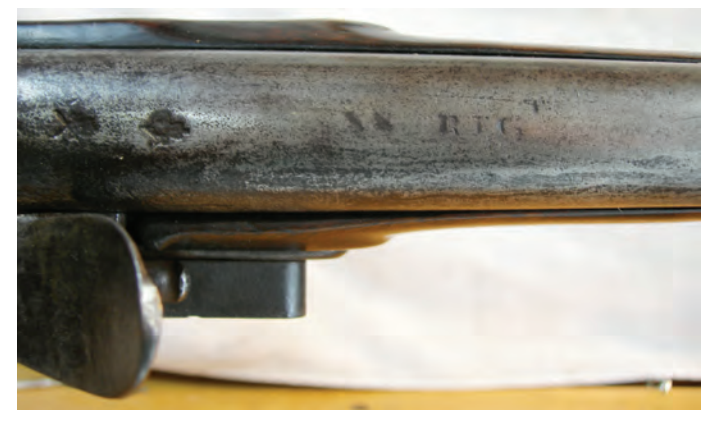
Figure 8. The musket was issued to the 20th Regiment and used in Ireland and later in Canada. The barrel is engraved: XX REG<sup>T</sup>.

The 20th Regiment served in Ireland until 1789, after which it was stationed in Canada arriving in Halifax on June 15, 1789. In 1793 the Regiment departed for the West Indies.<sup>9</sup> The musket illustrated was originally found in Baddeck on Cape Breton Island. The 20th Regiment is marked on the barrel (Figure 8) and "1st R CBM" (First Regiment Cape Breton Militia [Figures 9 and 10]) is neatly carved on the right hand side of the butt.