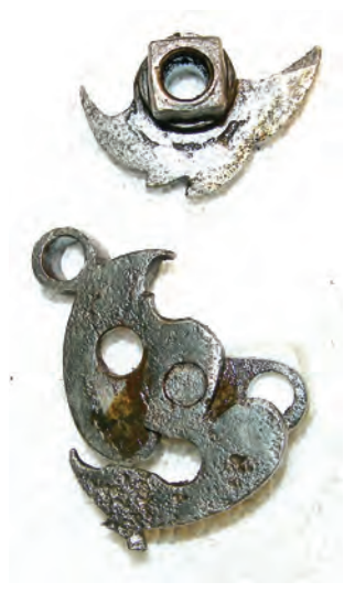
Figure 5. A close-up view of the tumbler and the two-piece bridle.

screws and the sear spring and frizzen spring hook over pins fixed to the lock plate. The tumbler bridle also fits over pins and is fixed into position by a plate fixed to the bridle, which rotates to hook under the slots in the pins that are located in the position conventionally occupied by the bridle screws. The cock screw, in addition to fixing the cock to the tumbler (Figures 5, 6, and 7), passes completely through the tumbler to act as the axis for the tumbler. The mainspring hooks under the pan fence simi-