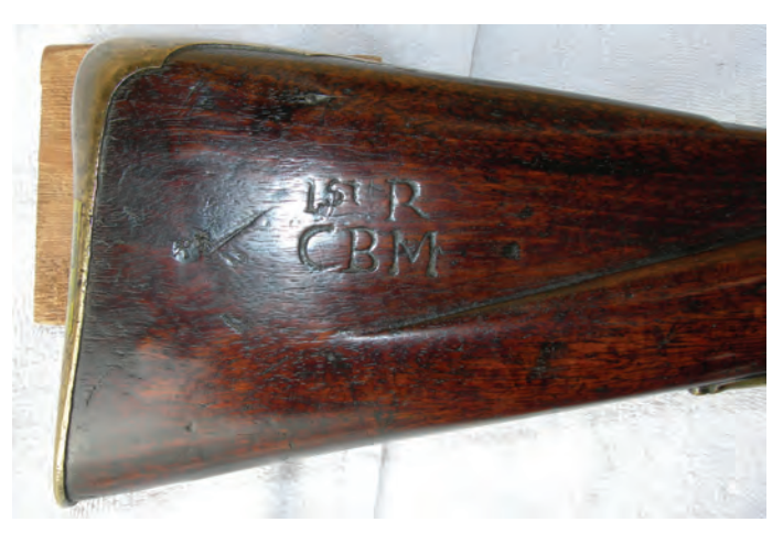
Figure 9. The musket is marked to the 1st Regiment of the Cape Breton Militia on the right side of the butt. Clearly this musket was left in Cape Breton when the Regiment departed for the West Indies in 1793. Whether or not all of the Hennem muskets were left behind in Cape Breton remains unknown.