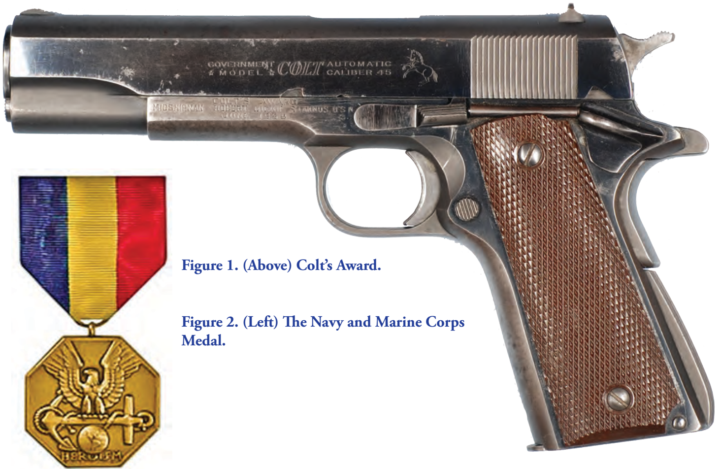
Figure 1. (Above) Colt's Award.