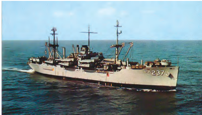
Figure 6. USS BEXAR

Commander, while at the Academy. On the U.S.S. Bexar he was editor of the ship's publication "The Roundup."