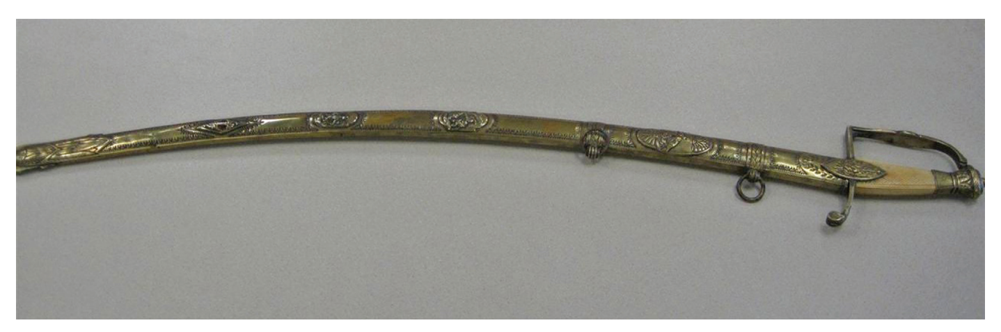
Figure 10. Photograph of the overall saber in scabbard.