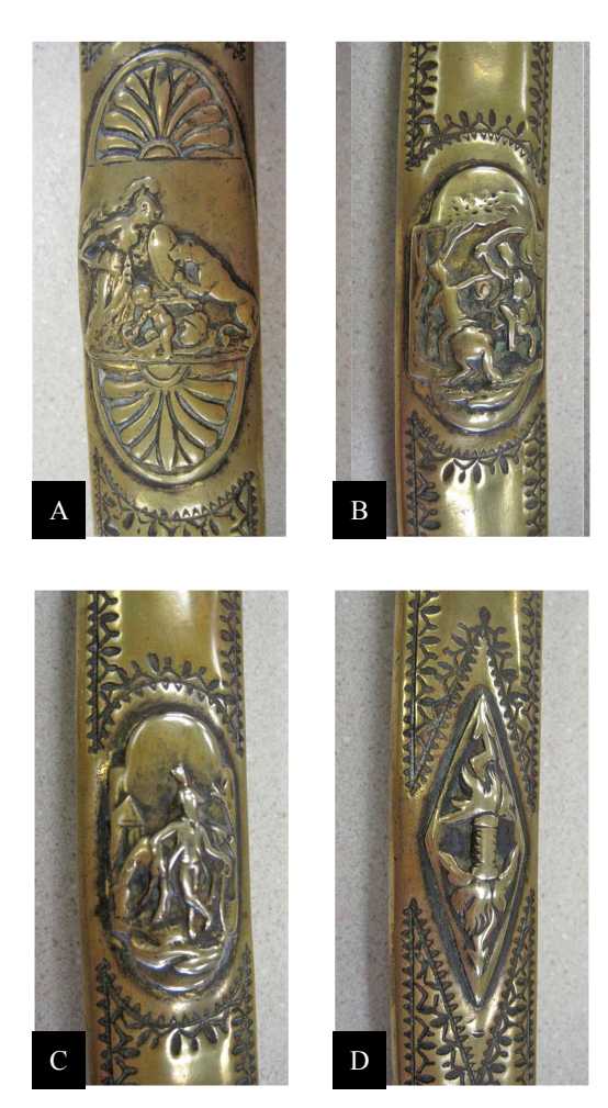
Figure 9. Close-ups of the four pressed-brass plaques applied to the scabbard.