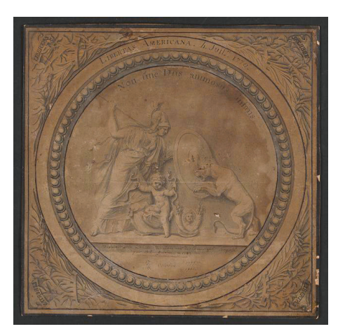
Figure 2. Libertas Americanca engraving by Esprit-Antoine Gibelin.

Non-precious metal versions of this medal were also struck. The two gold medals have been lost to history, but some of the original silver and non-precious metal versions of this medal still exist and are highly prized by collectors<sup>2</sup>. Bronze versions of the Libertas Americana are currently valued around $50,000 depending upon condition and silver versions of the medal have been known to be valued for as much as $200,000.