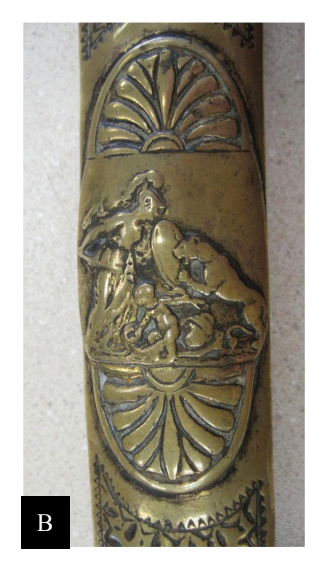
Figure 7. Close-up of the hilt (A) and one scabbard panel (B) of only known saber to have the image of the "Libertas Americana medal" incorporated into its design.

Blade (Figure 8): Long, thin, and curved blade with central fuller and false edge. Blade has traces of gilt under the langets. Part of original leather washer remains. Blade is 33" long by 1" wide.