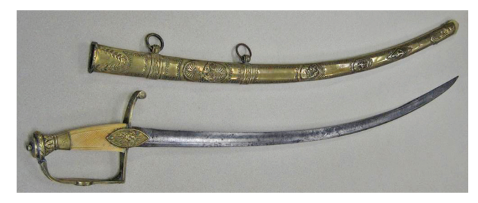
Figure 8. The blade drawn.

and reverse. The obverse has four pressed-brass plaques applied. The image on the top plaque is well known to early-American coin collectors as it is a copy of a medal originally conceived by Benjamin Franklin, referred to as the "Libertas Americana medal" (Figure 9A). The second plaque has two mounted dragoons in combat (Figure 9B). The third plaque depicts a standing officer in cocked hat in front of his horse (Figure 9C). The bottom plaque depicts the thunderbolt of Zeus (Figure 9D).