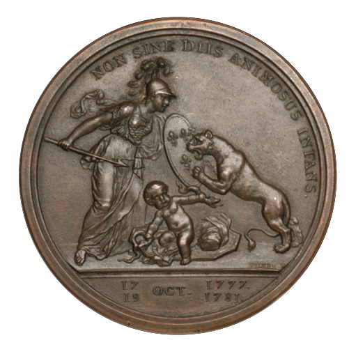
Figure 5. Reverse of the Libertas Americana Medal

the image was short lived, a mere seven years (1783-1789). By this time the American eagle was now the symbol of America, and after 1789, France was consumed with the French Revolution<sup>3</sup>.