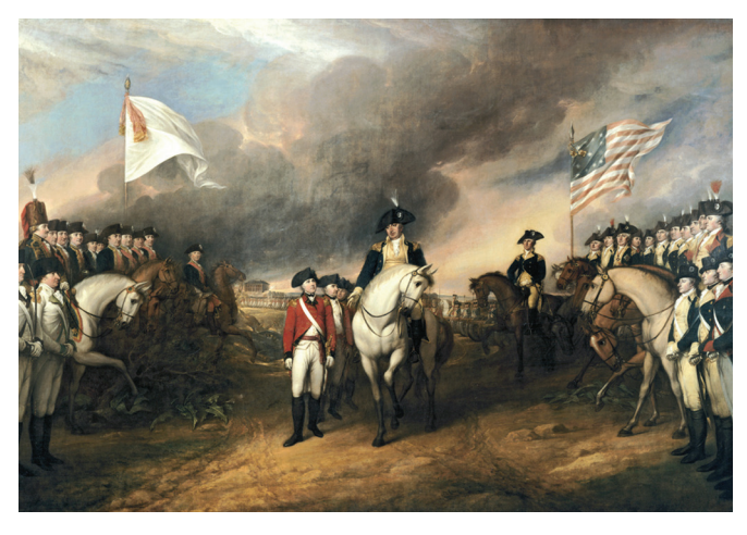
Figure 4. John Trumbull's painting of the British Surrender at the Battle of Yorktown. (U.S. Capitol in Washington, D.C.).

The image was also used on items such as fabric for export from France to the United States in the mid 1780s. But the demand for