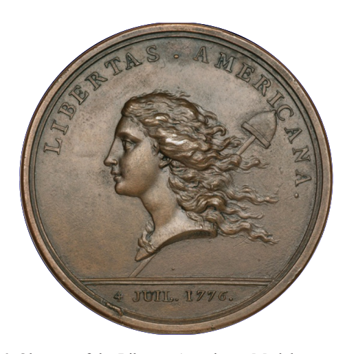
Figure 6. Obverse of the Libertas Americana Medal

My interest in the Libertas Americana medal began when I came across an online advertisement for the sword described in this article. The listing stated that the image of the Libertas Americana medal was on the scabbard. At the time I had never heard of the Libertas Americana medal but I was intrigued because my field of collecting is American swords from the Federal period, especially those made in France for the American market. I scrutinized the online photos and description. It was evident from the photographs that the saber was a French manufactured saber from the late 18th or first decade of the 19th century. I also noticed that the sword was being listed by a pawn shop and the contact information in the listing stated that the pawn shop was located in Woodbridge, Virginia, less than 10 miles from my home in Virginia.