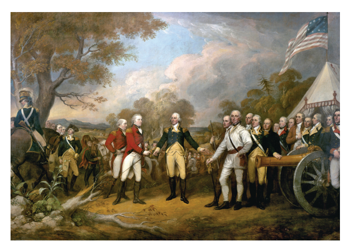
Figure 3. John Trumbull's painting of the British surrender at the Battle of Saratoga (U.S. Capitol in Washington, D.C.)