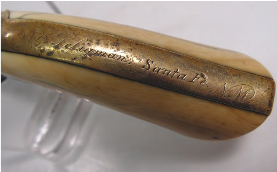
Figure 5. Seligman's 1851 Colt brass grip detail.

Indians, all equipped with long arms, pistols, and bow and arrow. This probably typifies the appearance of the trail freighters and their Kiowa guides.