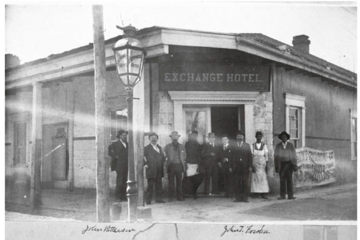
Figure 3. The Exchange Hotel.

quartermaster in the Union Army during the Civil War Battle of Valverde, NM, in March 1862.