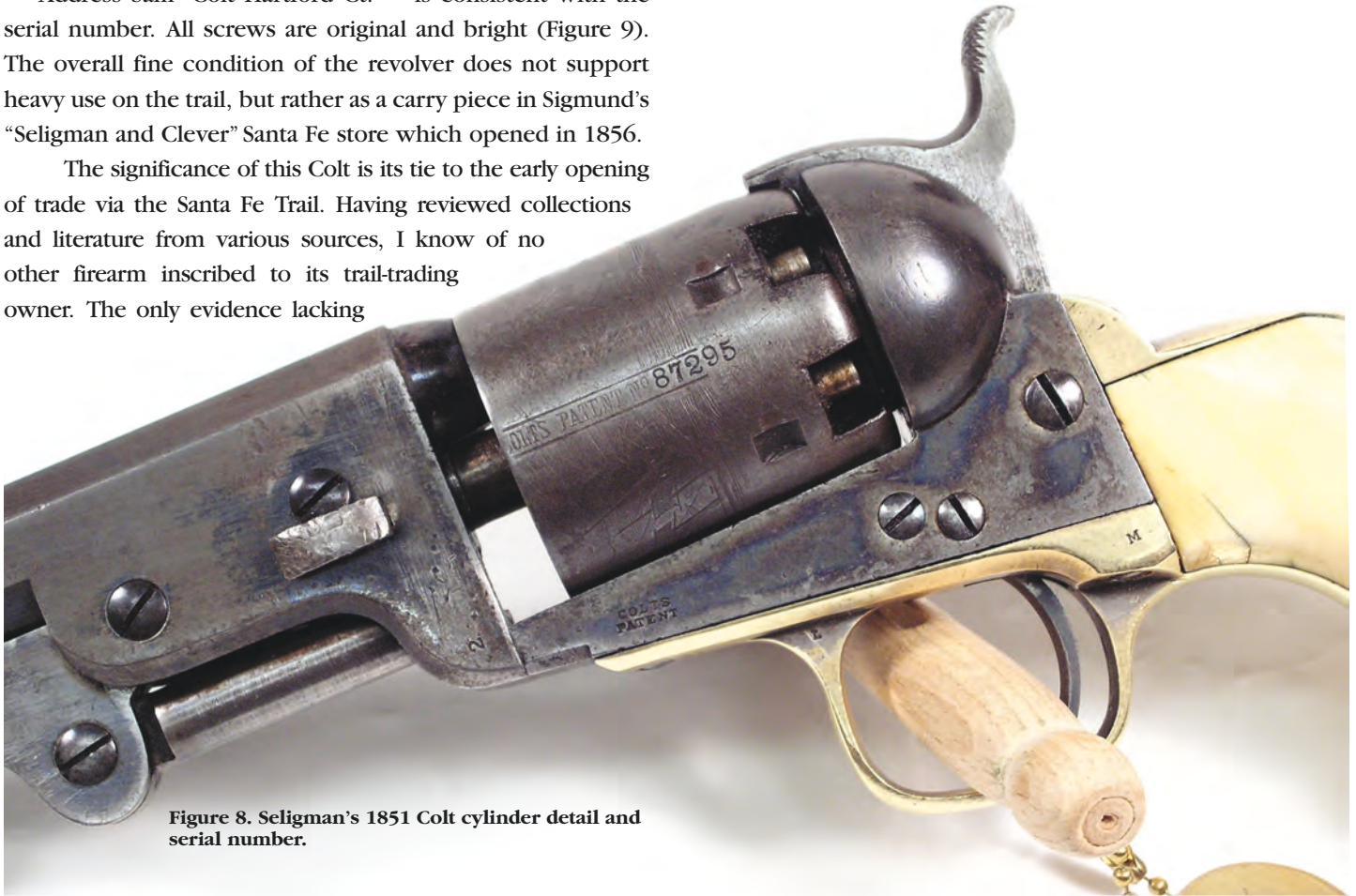
Figure 8. Seligman’s 1851 Colt cylinder detail and serial number.

The significance of this Colt is its tie to the early opening of trade via the Santa Fe Trail. Having reviewed collections and literature from various sources, I know of no other firearm inscribed to its trail-trading owner. The only evidence lacking