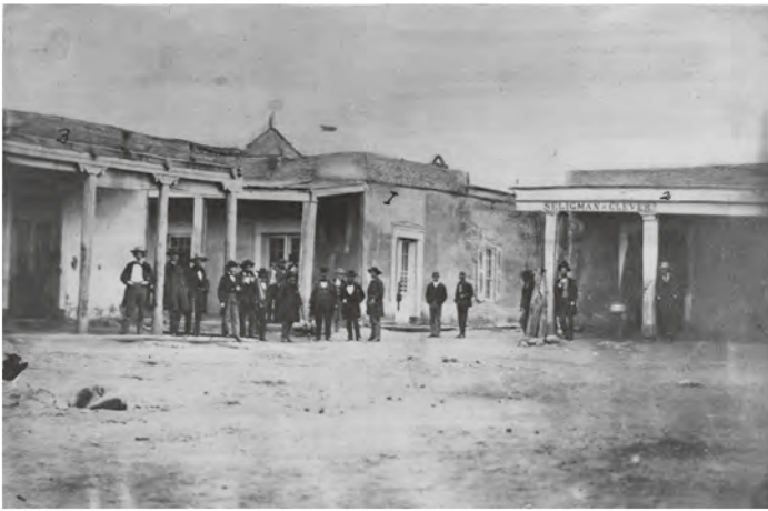
Figure 2. The Seligman and Clever Trading Post.

In about 1851, Sigmund also owned a business as a daguerreotype photographer, with a small studio on the Santa Fe plaza. He was associated with William Messervy, who became acting governor of the territory in 1854 (Figure 4). The photo of Messervy in Figure 4 shows his first or second model square back trigger guard, 1851 Colt revolver in his belt. He looks like the sort of governor we could use today. Sigmund's brother Bernard served as a captain and