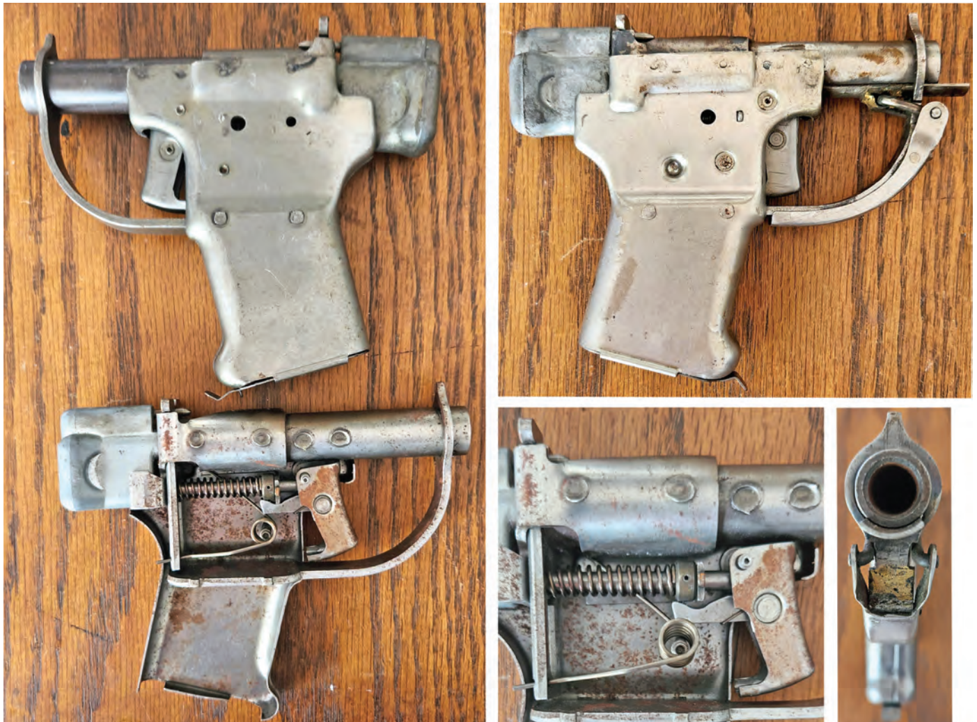
Figure 3. Detailed view of a FP-45 Liberator pistol. The open space in the bottom of the grip (lower left) stored additional ammunition (see frame 12 in Figure 4).

On May 12, 1942, that same day that the blueprints were being finished the Chief of Military Intelligence Service in Washington initiated an order for 1,000,000 pistols. That triggered a meeting of Officers from Army Ordnance, executives from Inland Division of G. M., and Guide Lamp Division of G. M. to discuss the next set in the manufacturing of this pistol. Much discussion was created because each division of General Motors wanted the contract. But on May 15, 1942, the contract for the FP-45 Pistol was signed by the military and G. M. Then General Motors assigned the Contract to Guide Lamp Division in Anderson, Indiana (Figure 2). This was the perfect decision for the contract because of the new welding systems, the new sheet metal processes, and the labor force already assembled at this plant. Over 300 people were sworn to secrecy and then started working on the project. They were working 24 hours a day and 7 days a week to finish the million pistols needed (Figure 3) and get them to the war effort. Over one and half million rounds of 45 APC rounds were used to test the pistols, and another million 45 APC rounds were sent with the pistols. 5