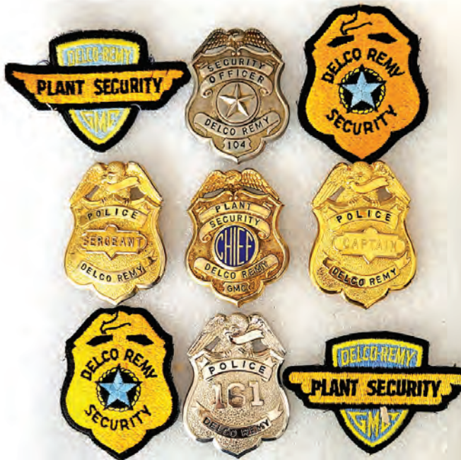
Figure 2. Guide Lamp Division in Anderson, Indiana of General Motors; aerial layout of the factory (top), interior range for testing firearms (center) and security badges from the production plant (bottom)

The Liberator Pistol Project history started on March 5th, 1942, in the following memorandum: